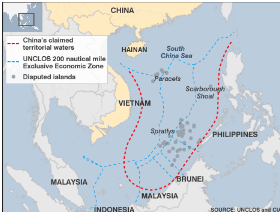
Figure 2. Contested Boundaries in the South China Sea

Sino-Philippine maritime tensions have continued since that incident. Since February 2013, China reportedly has sent naval vessels to the Second Thomas Shoal ( Ayungin ), in the Spratly Islands group, in an apparent attempt to isolate and bring about an end to the Philippines presence there. Since 1999, the AFP has stationed several troops on the BRP Sierra Madre , a U.S. World War II-era naval vessel which the Philippines acquired in 1976 and intentionally ran aground in the shoal in order to maintain its claim to the area. In March 2014, two Chinese coastguard ships reportedly blocked two Philippine supply ships from reaching the Sierra Madre , claiming that they were carrying construction materials.