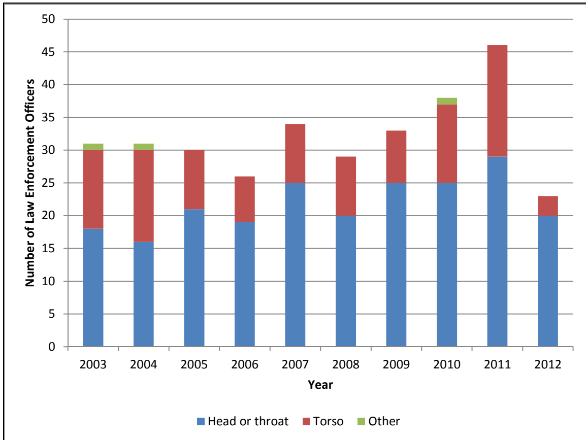
Figure 2. Location of Fatal Wound for Law Enforcement Officers Killed with a Firearm While Wearing Body Armor