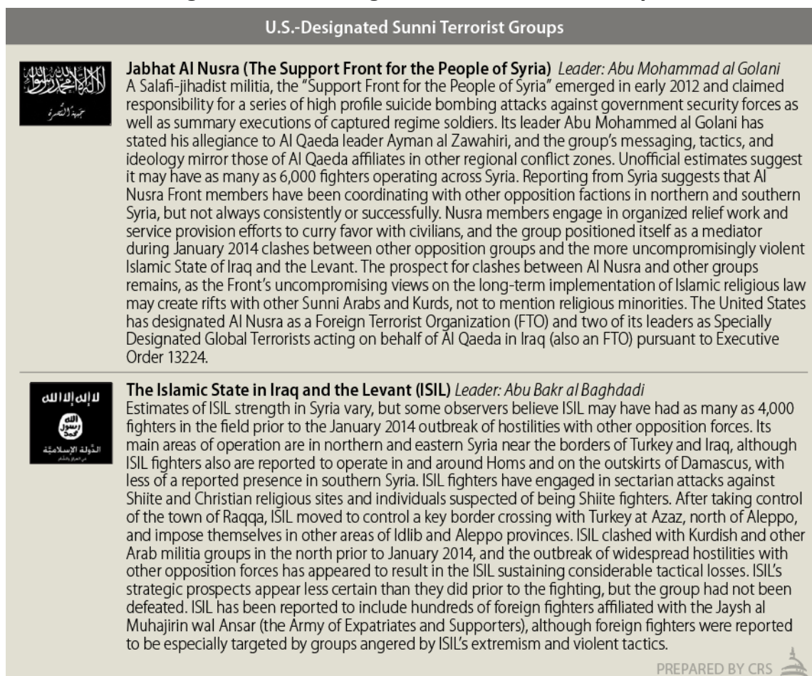
Figure A-2. U.S.-Designated Sunni Terrorist Groups