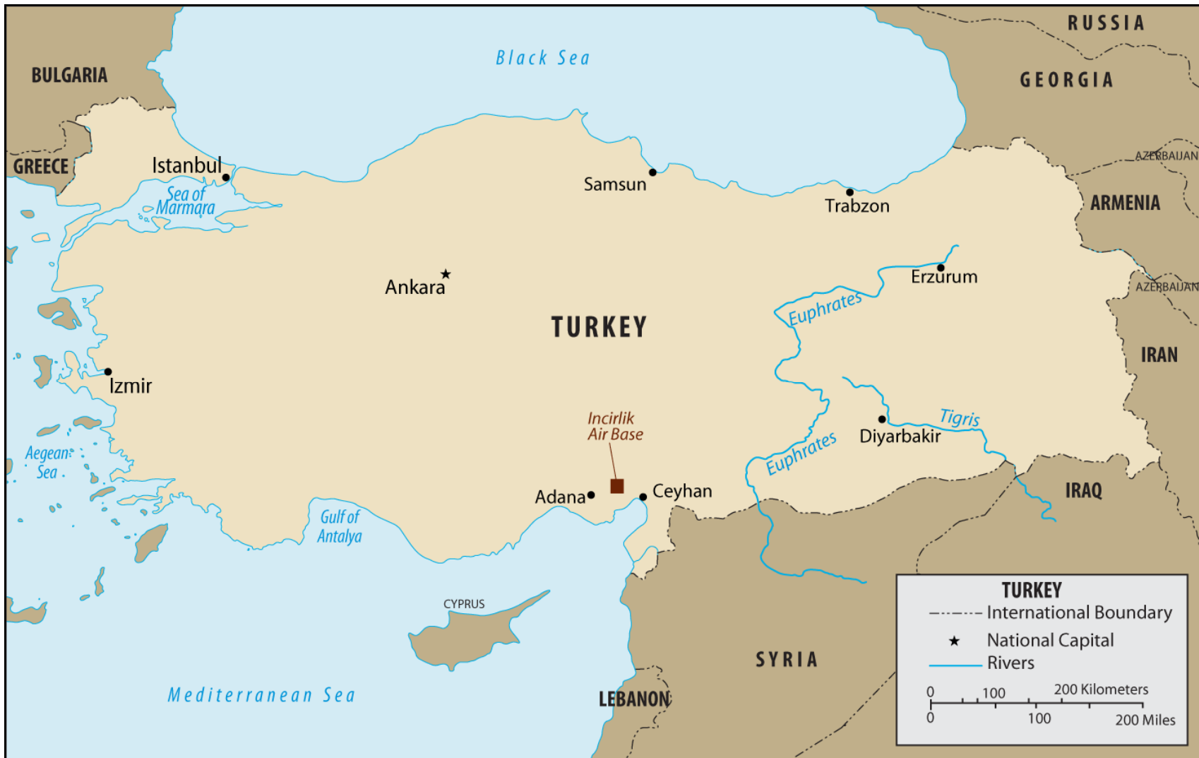
Figure 1. Turkey and Its Neighbors