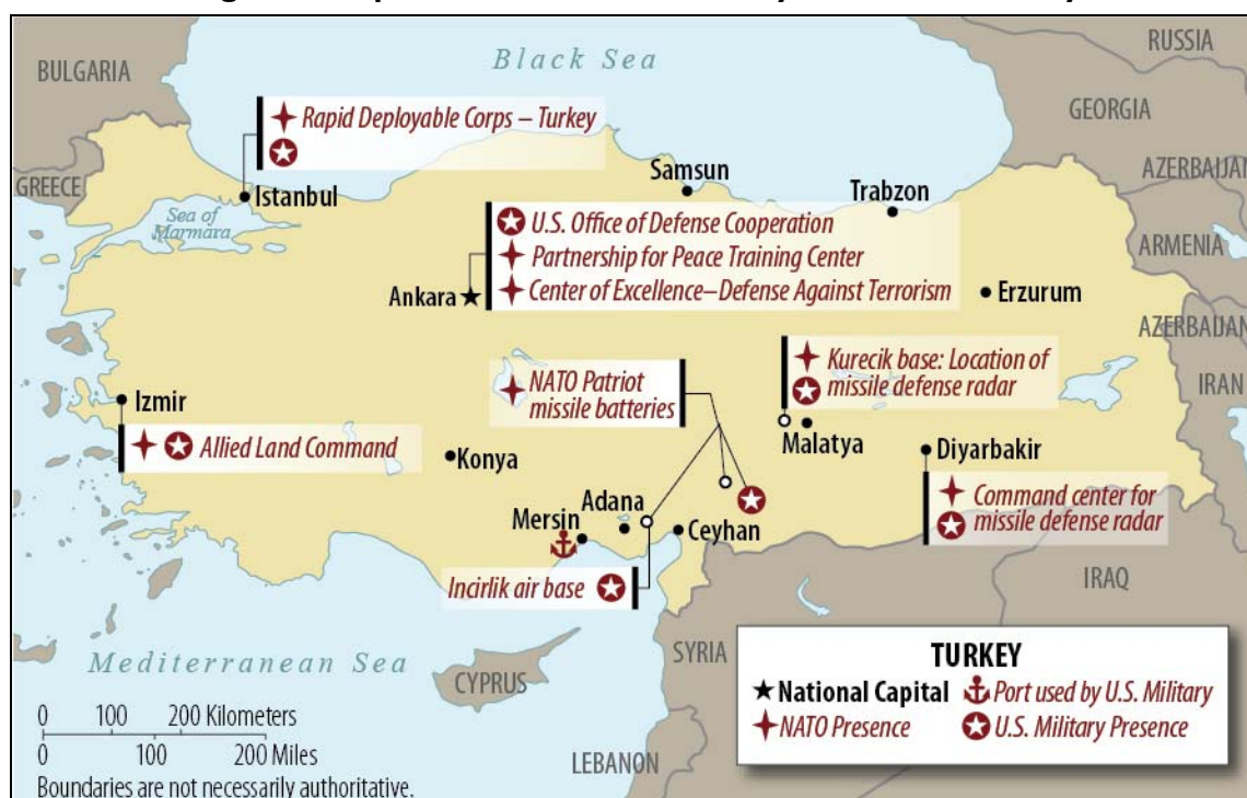
Figure 2. Map of U.S. and NATO Military Presence in Turkey