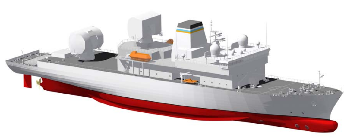
Figure 3. Cobra Judy Replacement Ship