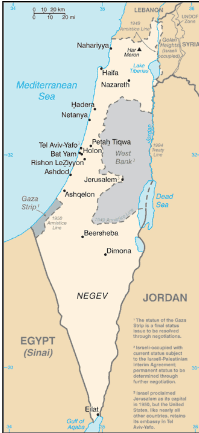
Figure I. Map of Israel