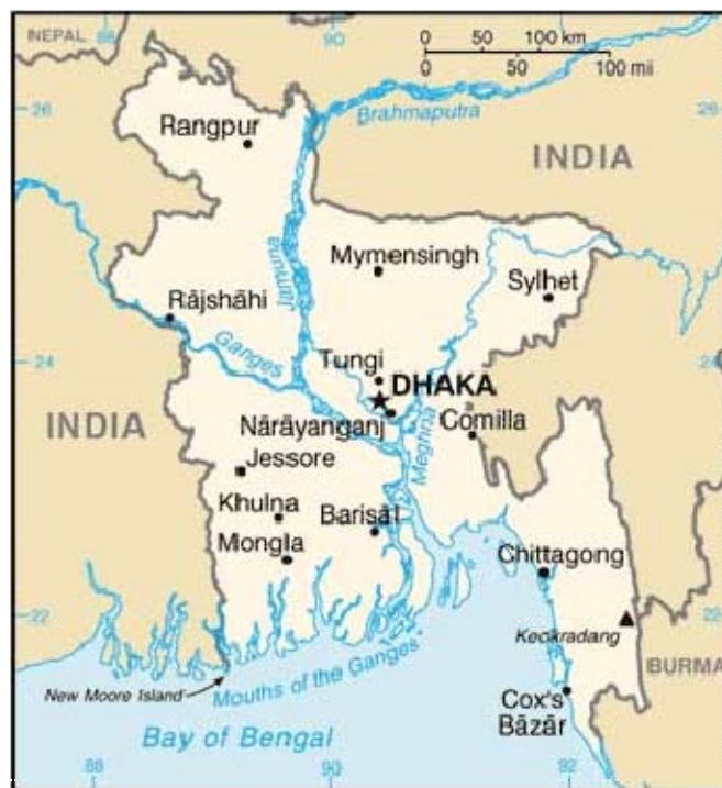
Figure 1. Map of Bangladesh

On April 24, 2013, Rana Plaza, an eight-story building, in Dhaka, Bangladesh, collapsed, killing more than 1,100 garment workers. It brought international focus on portions of the global supply chain. It also raised the issue of what might be done to improve working conditions, especially for lower-wage workers in developing countries around the world.