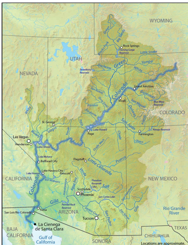
Figure 4. Colorado River Basin