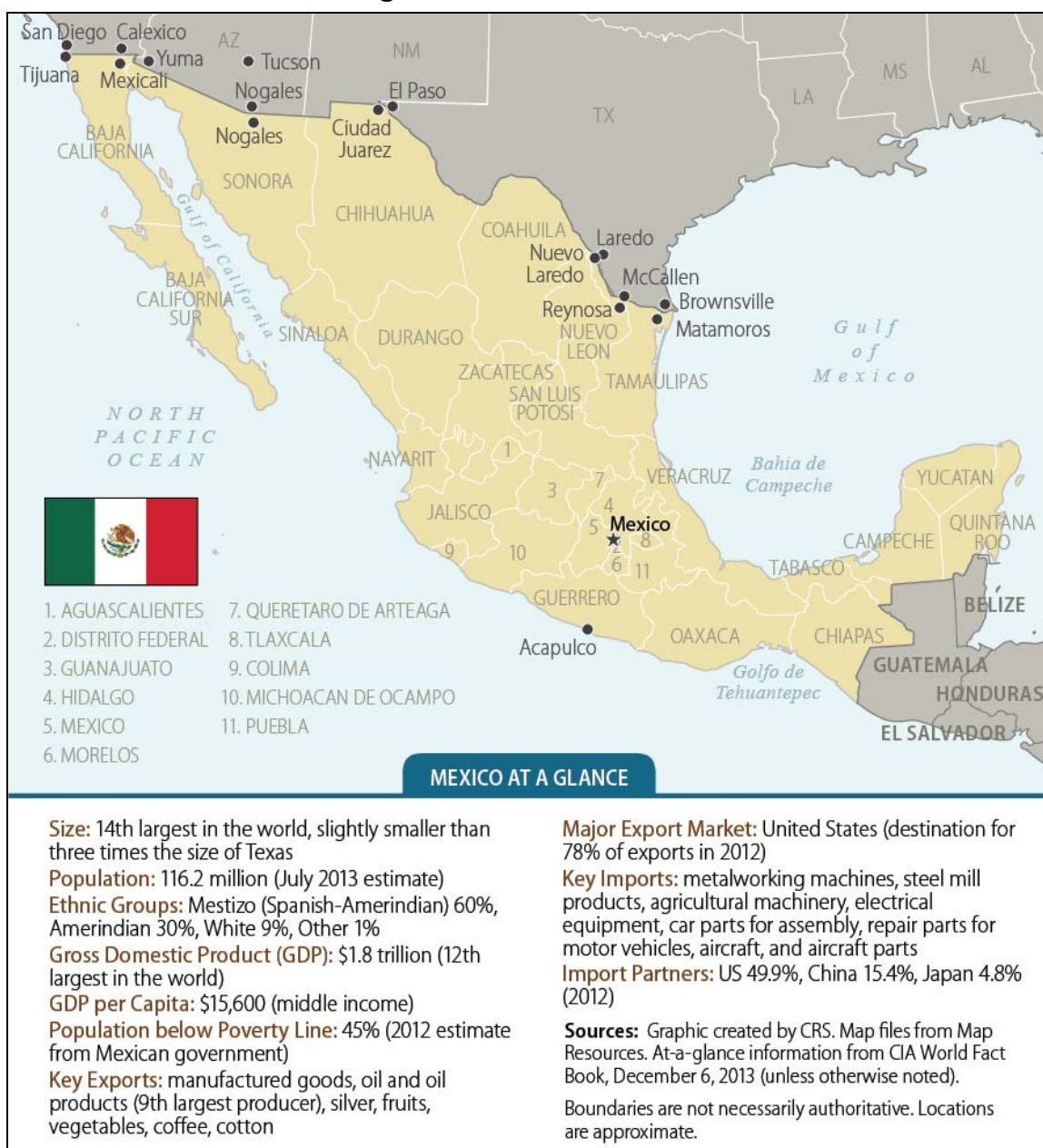
Figure I. Mexico at a Glance