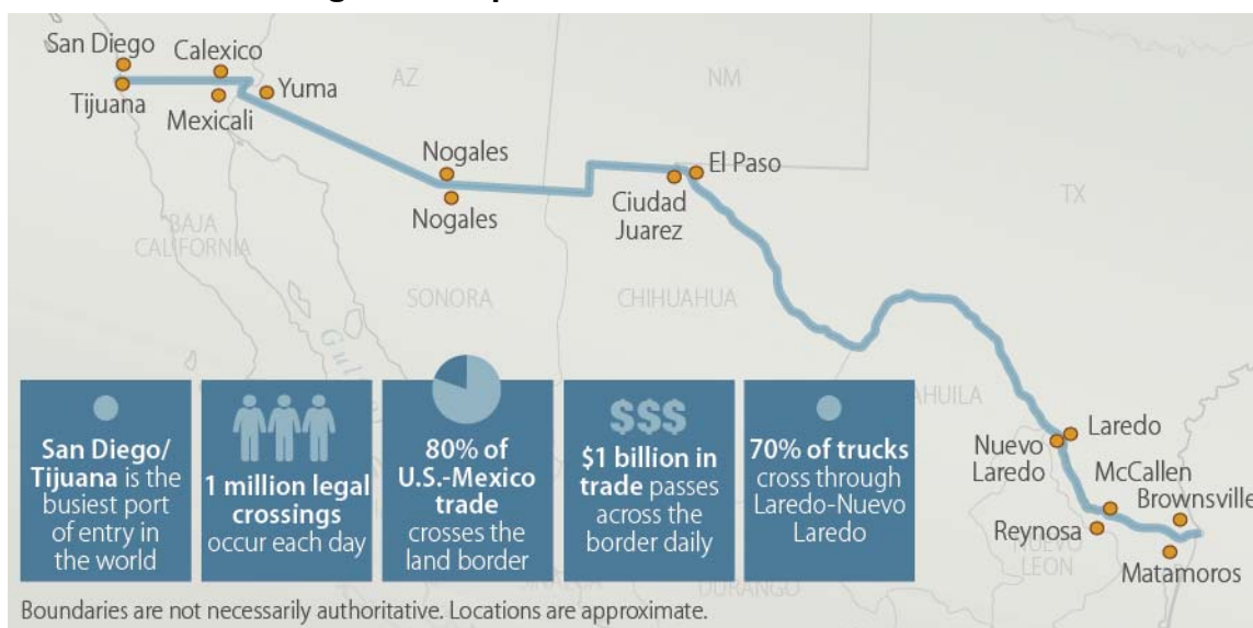
Figure 3. Snapshot of the U.S.-Mexico Border