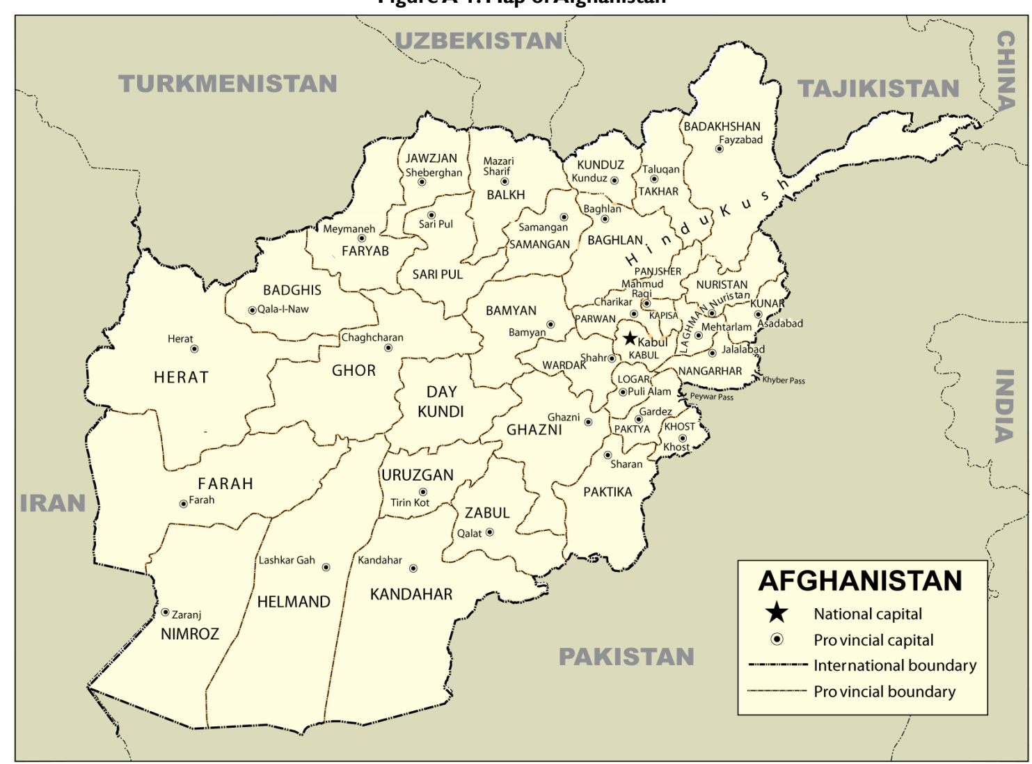
Figure A-I. Map of Afghanistan