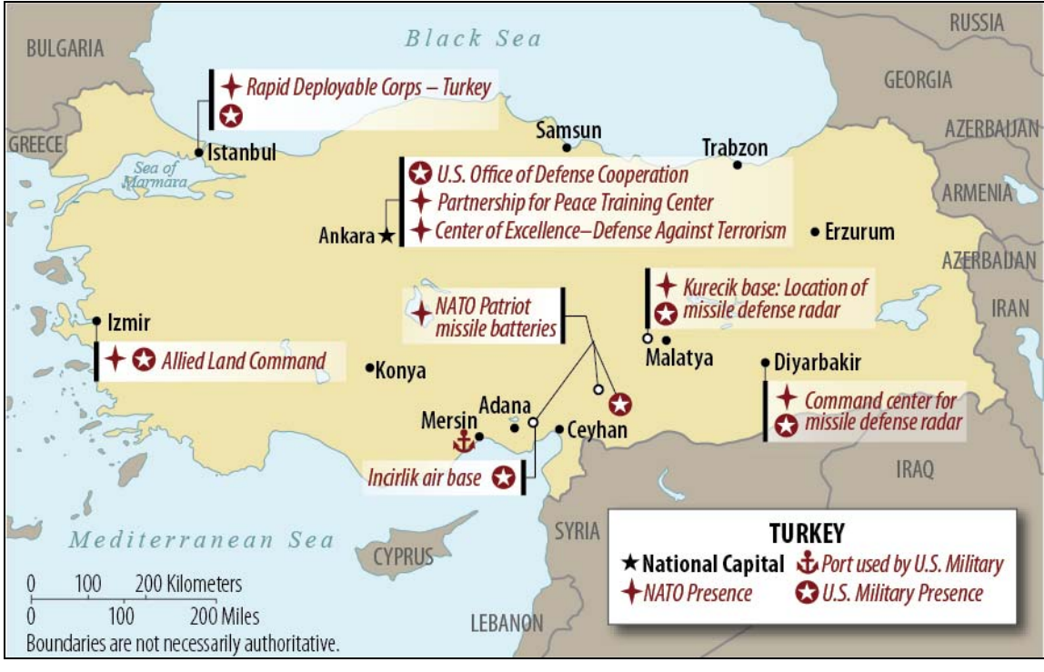
Figure 2. Map of U.S. and NATO Military Presence in Turkey