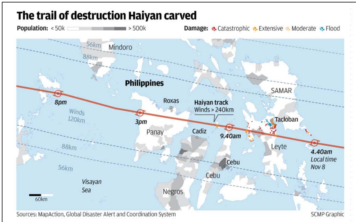
Figure 2. Haiyan's Path and Destruction