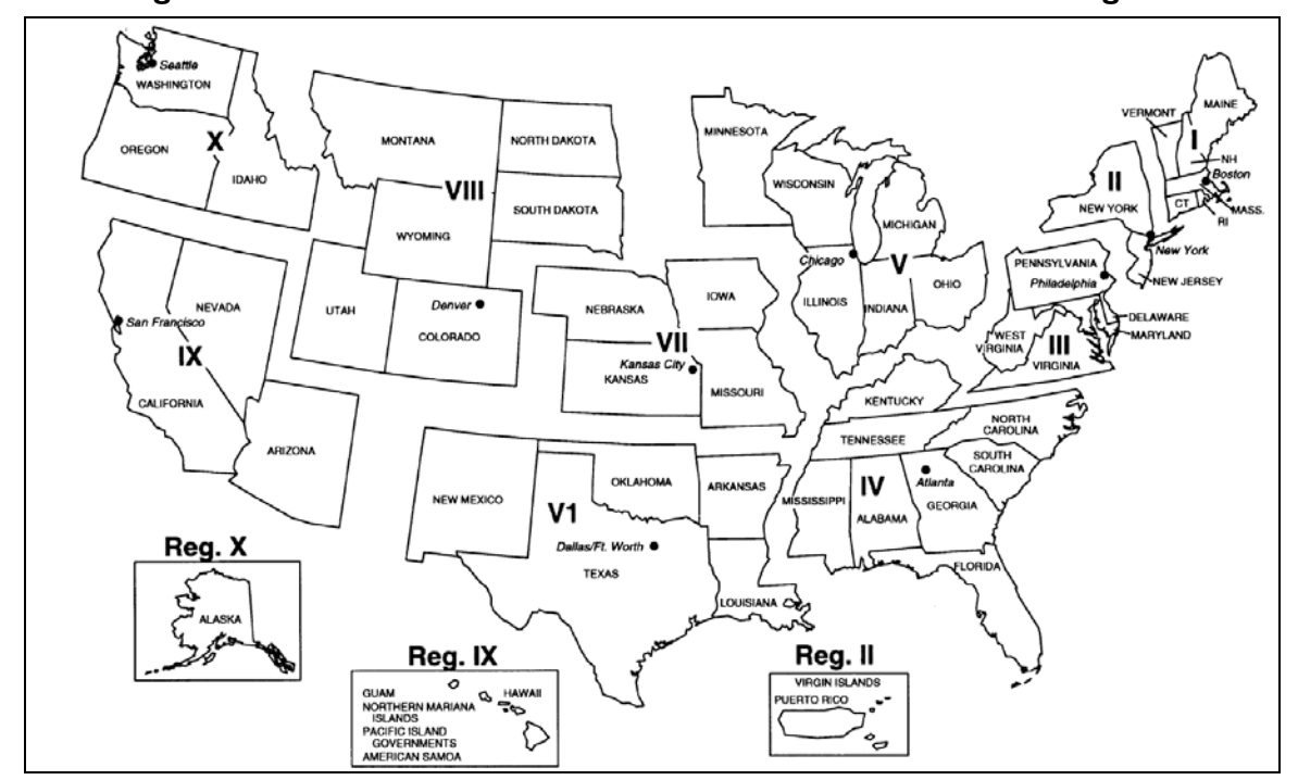
Figure 2. Standard State and Territorial Boundaries for Federal Regions

Enacted in 1986, the Emergency Planning and Community Right-to-Know Act (EPCRA)<sup>38</sup> required each state to create a State Emergency Response Commission (SERC), designate emergency planning districts, and establish Local Emergency Planning Committees (LEPCs) for each district. Each LEPC must prepare a local emergency response plan for the emergency planning district. These local emergency plans are integrated into the appropriate geographic-specific area response plan that may cover several local planning districts, <sup>39</sup> discussed in the "Area Committees" section of this report below.