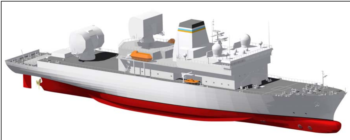
Figure 3. Cobra Judy Replacement Ship