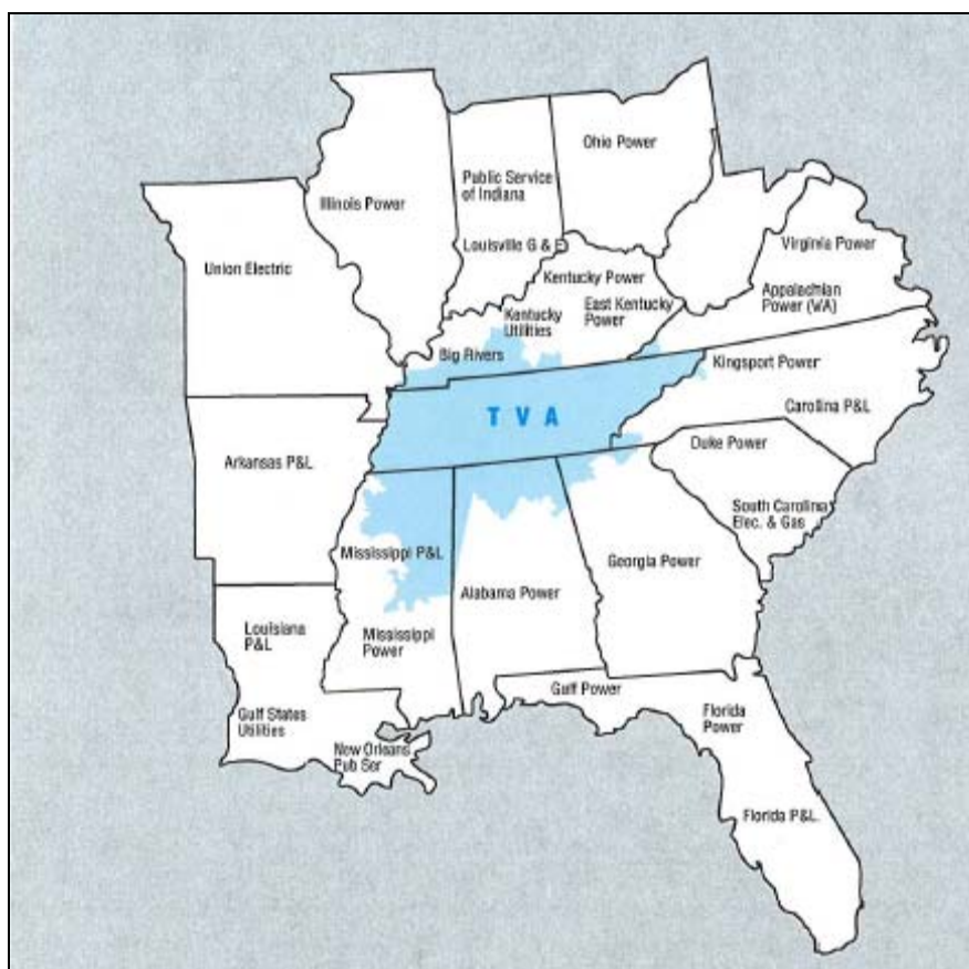
Figure I. TVA Service Territory