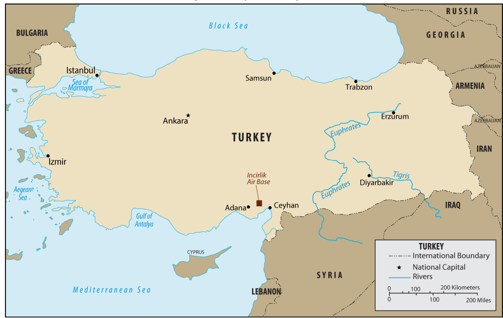
Figure 1.Turkey and Its Neighbors