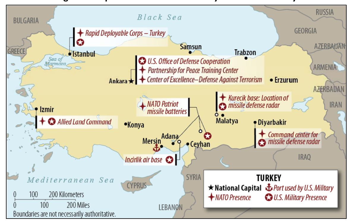
Figure 3. Map of U.S. and NATO Military Presence in Turkey