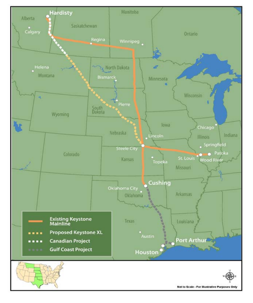
Figure 1. Existing Keystone Pipeline and Proposed Keystone Expansions

entire Keystone Pipeline System may ultimately have the capacity to deliver up to 1.3 million bpd of crude oil. The existing Keystone Pipeline and proposed expansions are illustrated in Figure 1 . The proposed Keystone XL Project and associated pipeline segments are illustrated in Figure 2 .