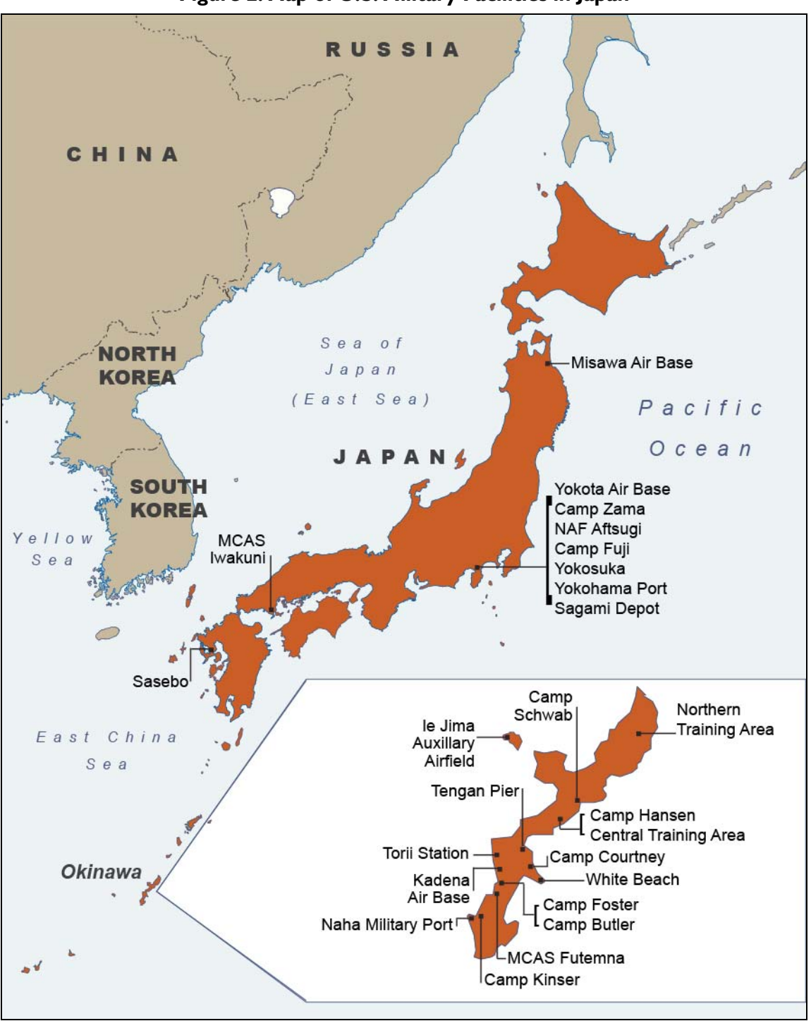
Figure 2. Map of U.S. Military Facilities in Japan