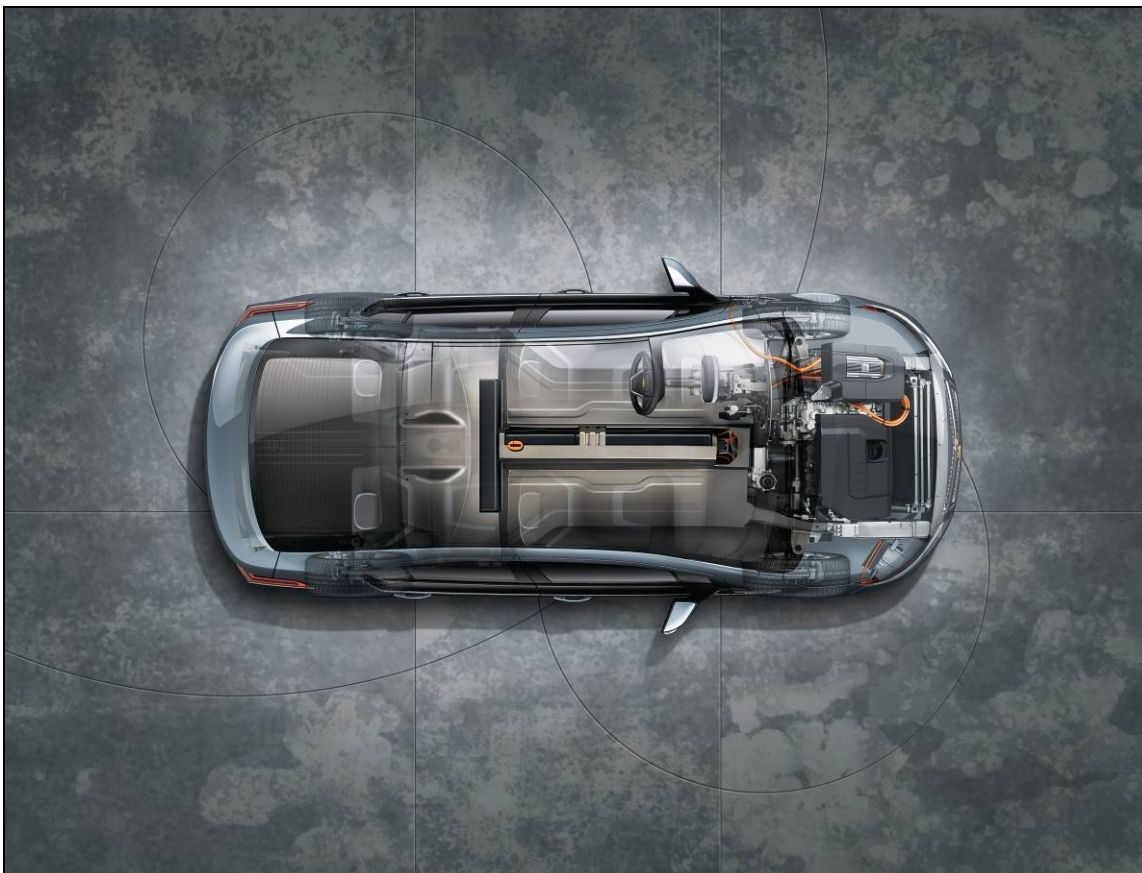
Figure B-1. Overview of the GM Volt