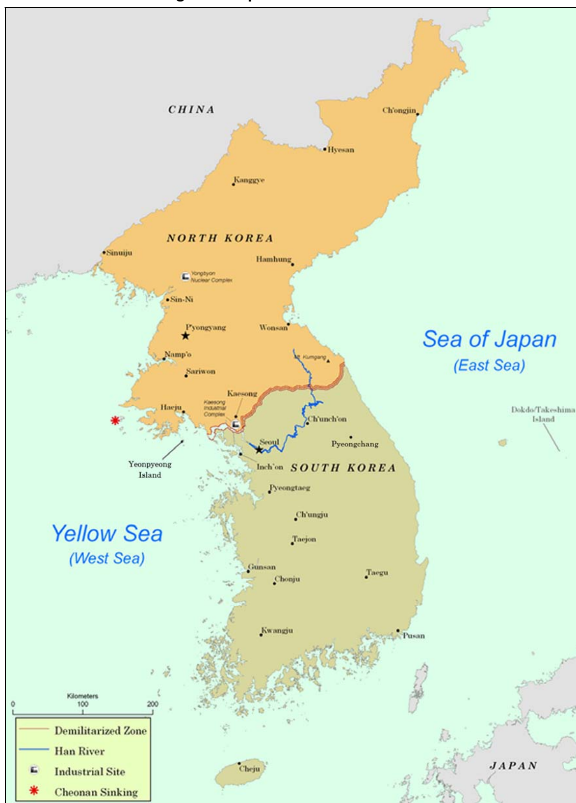
Figure I. Map of the Korean Peninsula