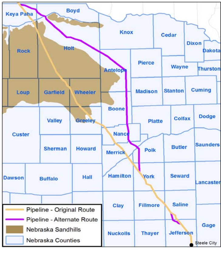
Figure 2. Keystone XL Preferred Alternative Route in Nebraska