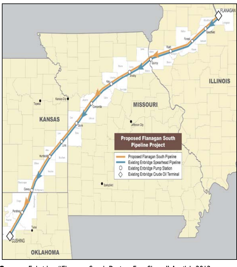
Figure 4. Proposed Enbridge Flanagan South Pipeline Route