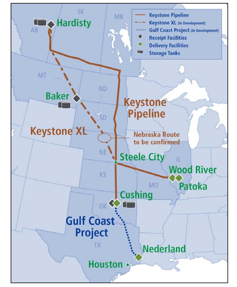
Figure 1. The TransCanada Keystone Pipeline System: Keystone and Keystone XL

The Keystone Pipeline System, with both the completed Keystone and proposed segments of the Keystone XL, is illustrated in Figure 1 .