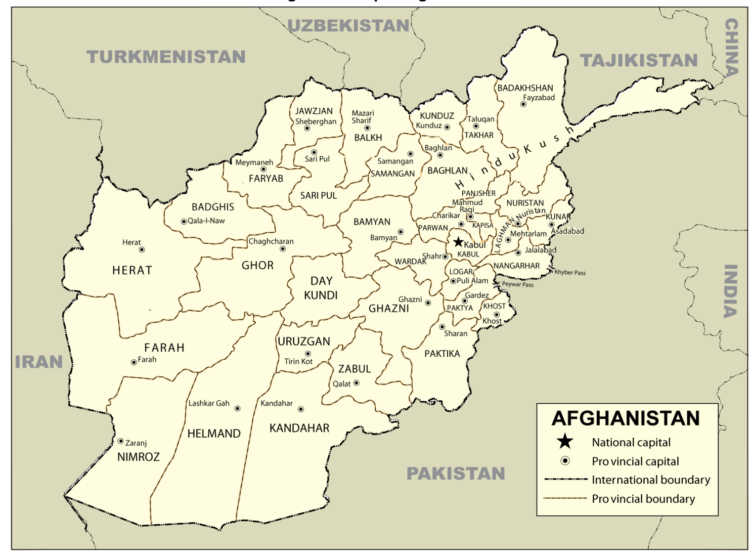
Figure A-I. Map of Afghanistan