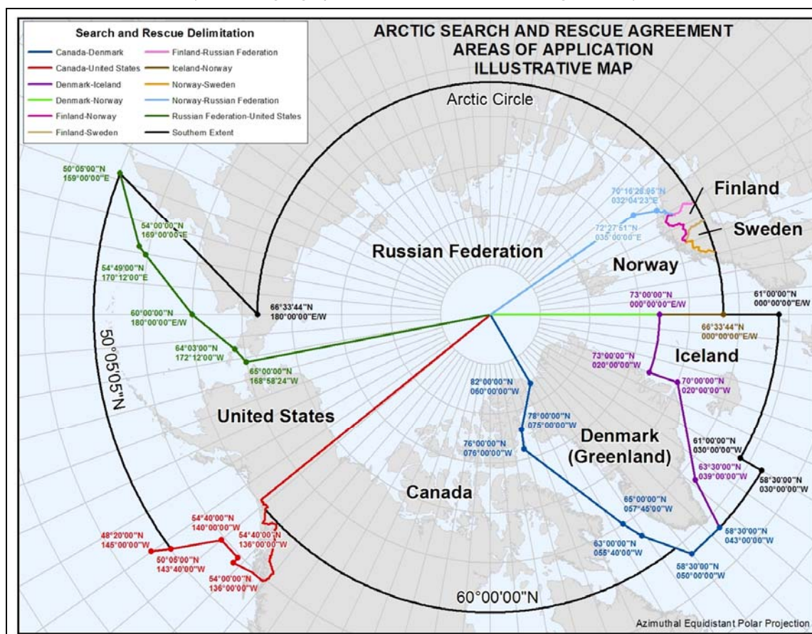
Figure 4. Illustrative Map of Arctic SAR Areas in Arctic SAR Agreement (Based on geographic coordinates listed in the agreement)

Source: "Arctic Search and Rescue Agreement," accessed July 7, 2011 at http://www.arcticportal.org/features/features-of-2011/arctic-search-and-rescue-agreement .