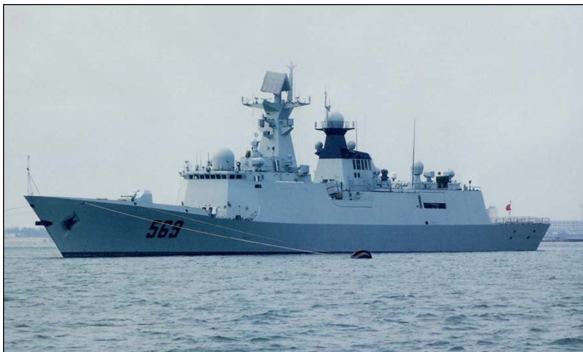
Figure 7. Jiangkai II (Type 054A) Class Frigate