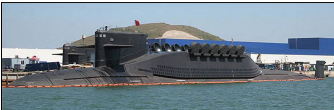
Figure 1. Jin (Type 094) Class Ballistic Missile Submarine