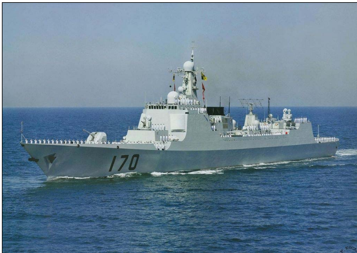
Figure 6. Luyang II (Type 052C) Class Destroyer