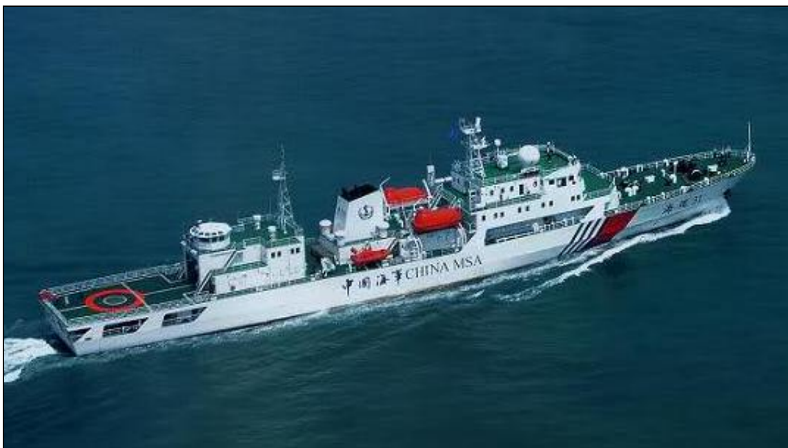
Figure 10. Haixun 01 Maritime Patrol Ship