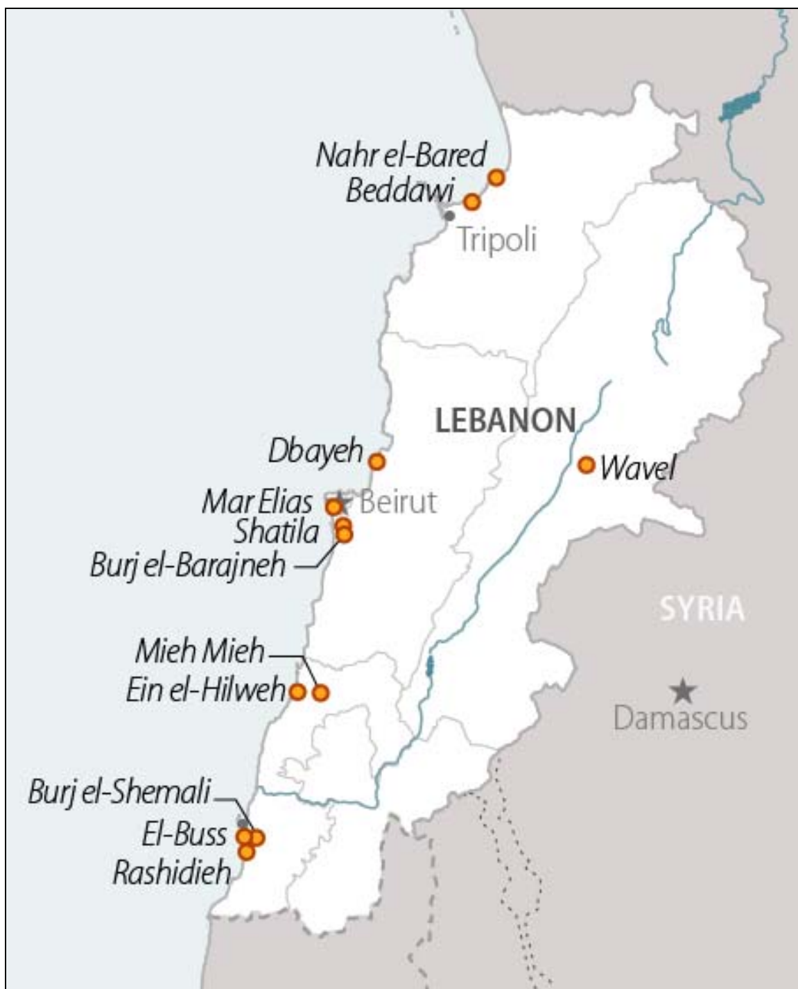
Figure 4. Location of Palestinian Refugee Camps in Lebanon