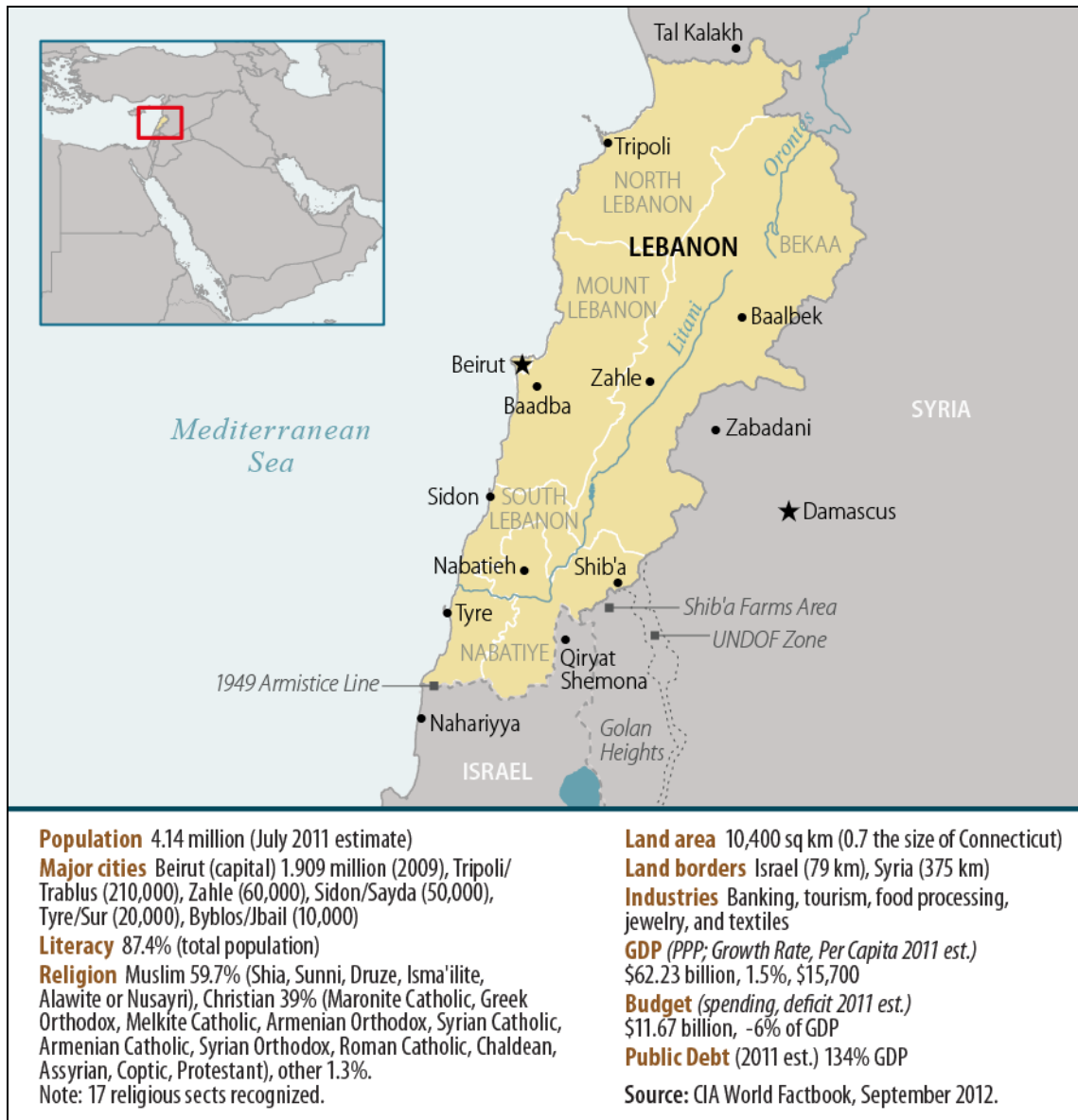
Figure 1. Lebanon at a Glance