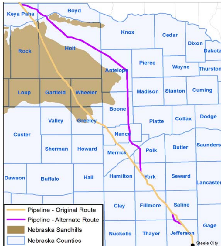
Figure 2. Keystone XL Preferred Alternative Route in Nebraska