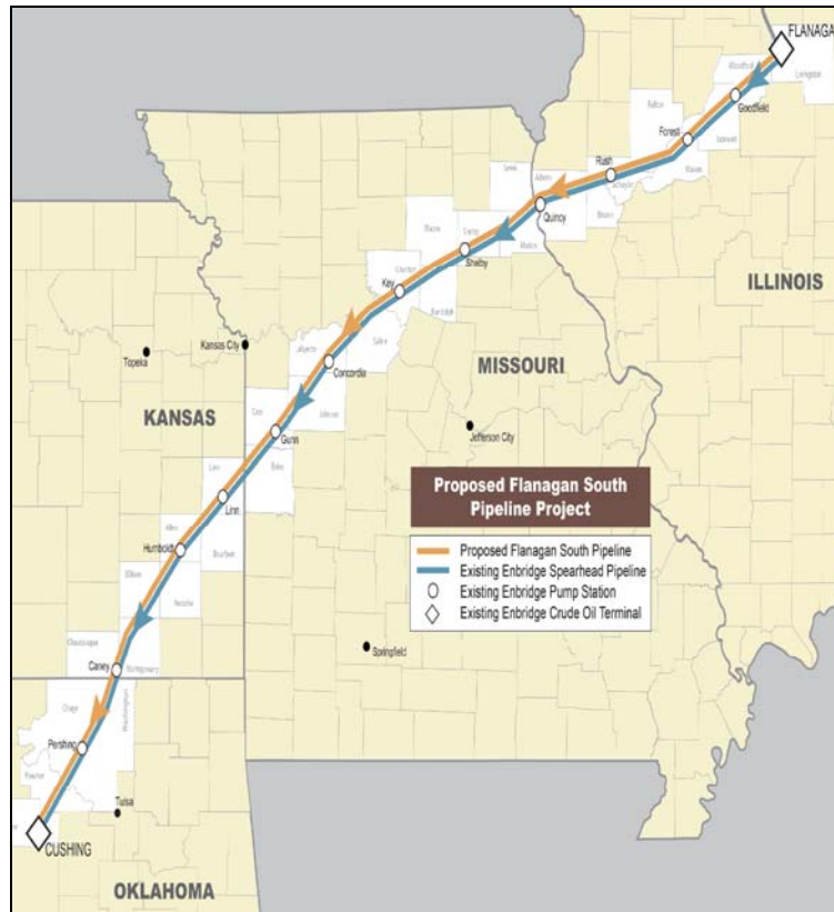
Figure 4. Proposed Enbridge Flanagan South Pipeline Route