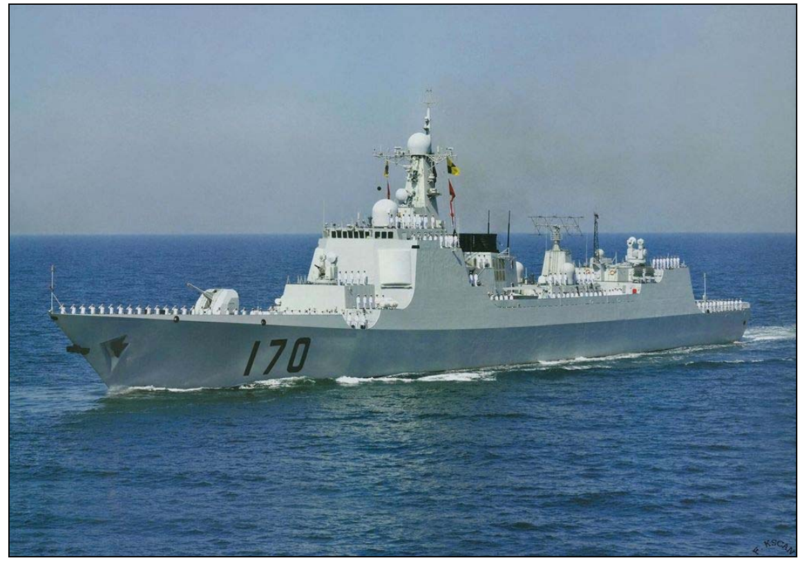
Figure 6. Luyang II (Type 052C) Class Destroyer

China since the early 1990s has deployed six new classes of indigenously built destroyers, two of which are variations of another. The classes are called the Luhu (Type 052), Luhai (Type 051B), Luyang I (Type 052B), Luyang II (Type 052C), the Luyang III (Type 052D), and Louzhou (Type 051C) designs. Compared to China's remaining older Luda (Type 051) class destroyers, which entered service between 1971 and 1991, these six new indigenously built destroyer classes are substantially more modern in terms of their hull designs, propulsion systems, sensors, weapons, and electronics. The Luyang II-class ships ( Figure 6 ) and the Luyang III-class ships appear to feature phased-array radars that are outwardly somewhat similar to the SPY-1 radar used in the U.S.-made Aegis combat system.<sup>69</sup> Like the older Luda-class destroyers, these six new destroyer classes are armed with ASCMs.