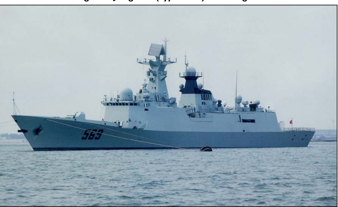
Figure 7. Jiangkai II (Type 054A) Class Frigate