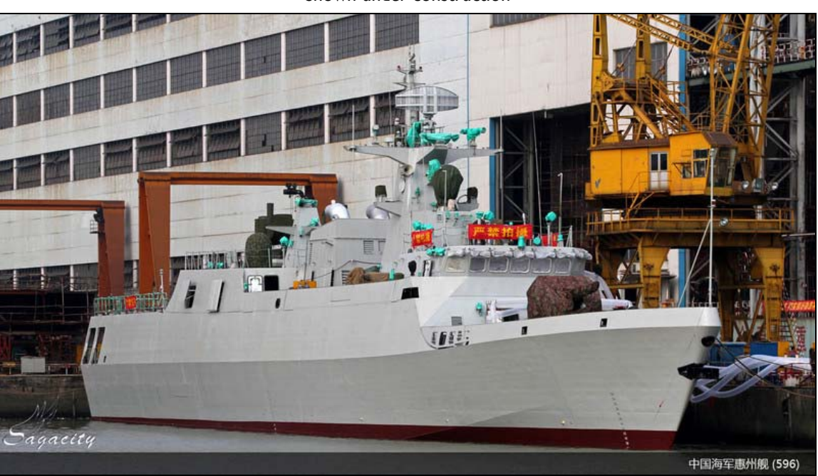
Figure 8. Type 056 Corvette