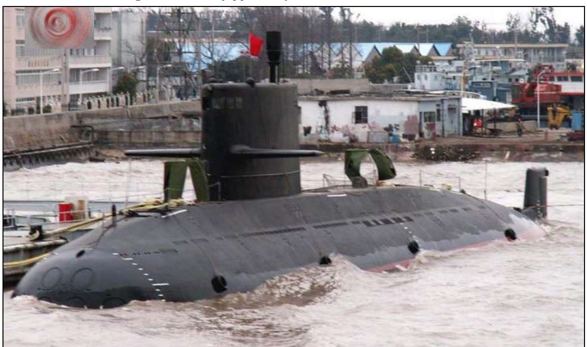
Figure 2.Yuan (Type 041) Class Attack Submarine