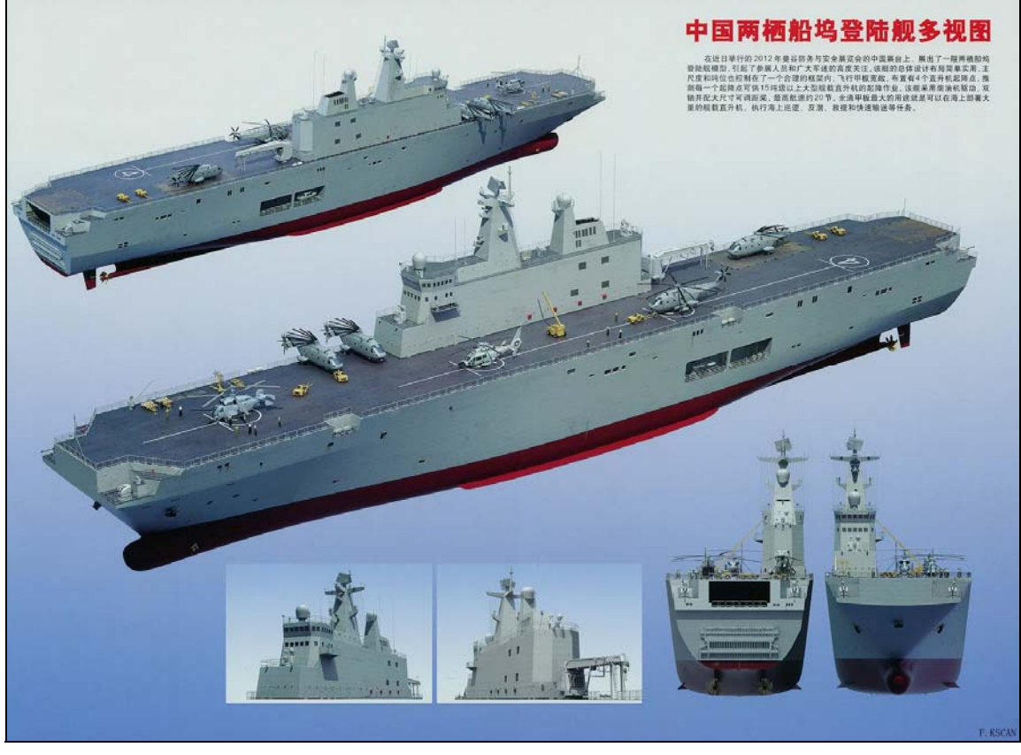
Figure 12. Type 081 LHD (Unconfirmed Conceptual Rendering of a Possible Design)