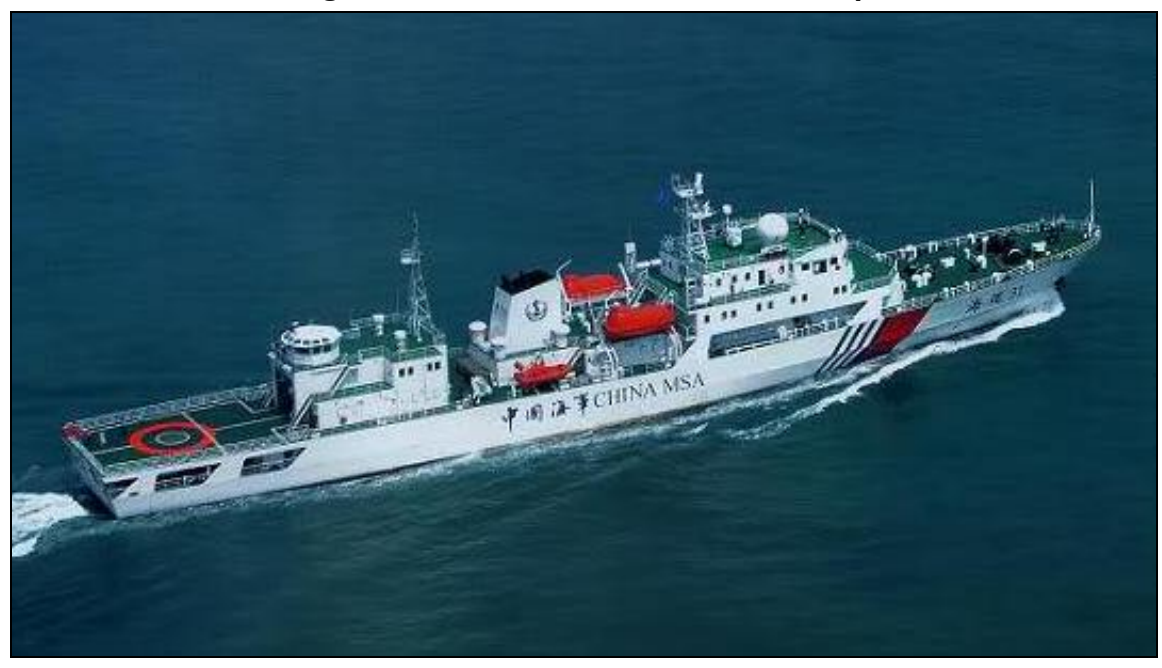
Figure 10. Haixun 01 Maritime Patrol Ship

Figure 10 shows a picture of the above-discussed Haixun 01 maritime patrol ship.