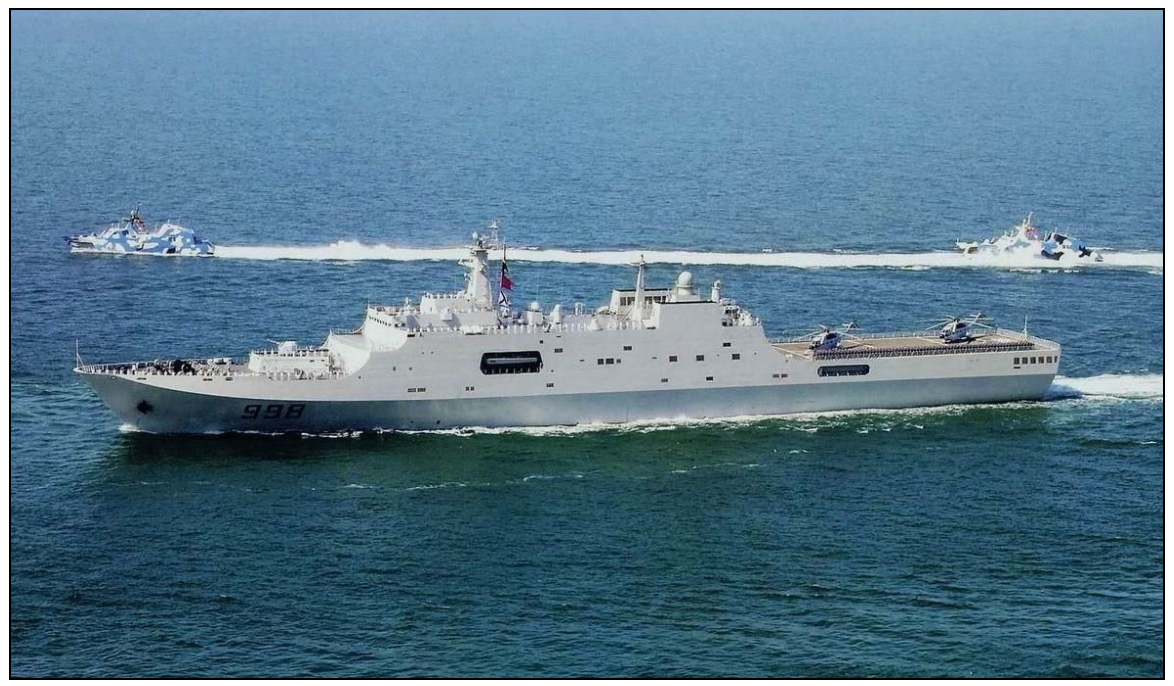
Figure 11.Yuzhao (Type 071) Class Amphibious Ship

With two Houbei (Type 022) fast attack craft behind