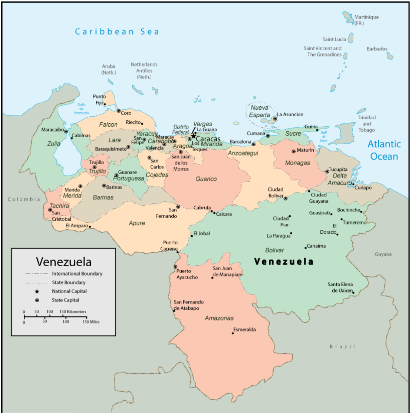
Figure 1. Map of Venezuela