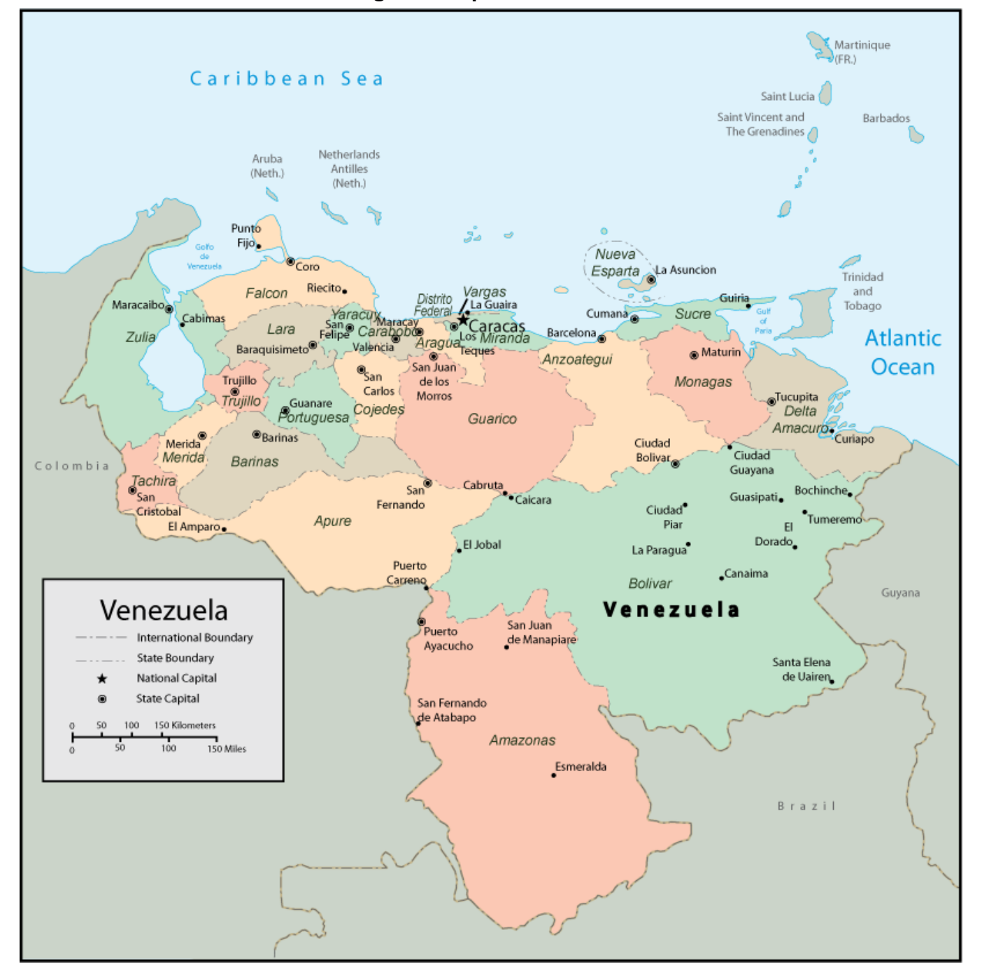
Figure 1. Map of Venezuela