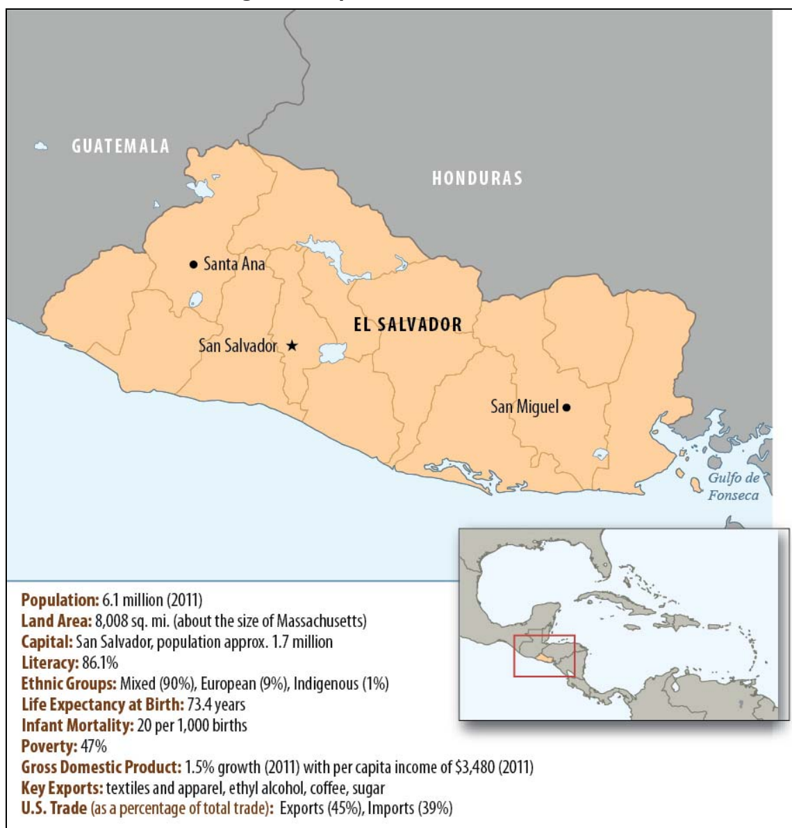
Figure 1. Map and Data on El Salvador