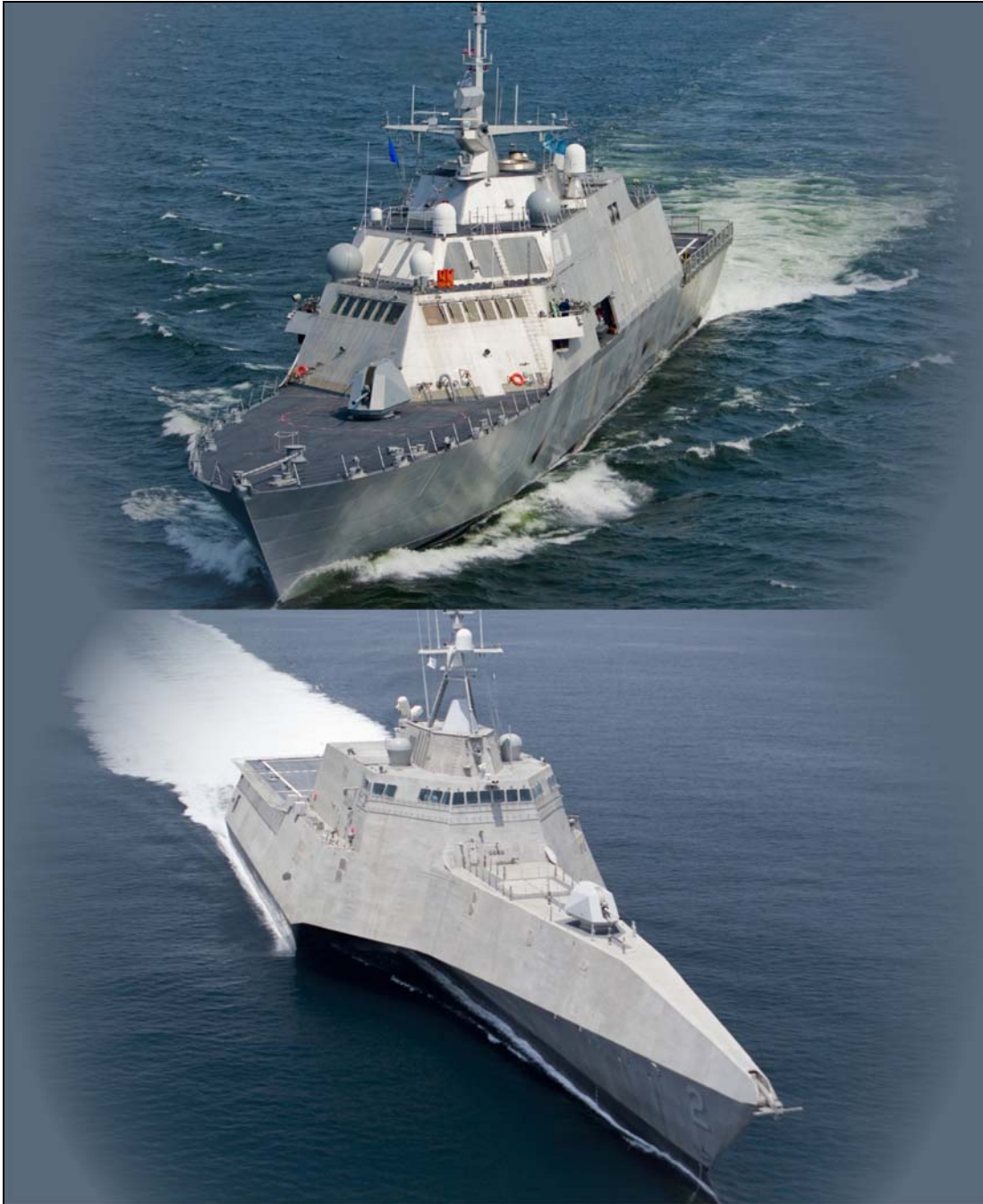
Figure 1. Lockheed LCS Design (Top) and General Dynamics LCS Design (Bottom)