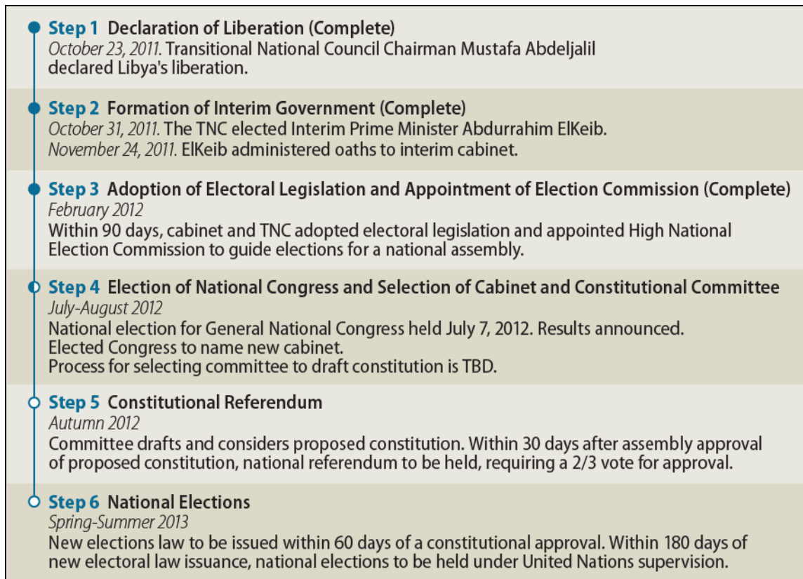
Figure 3. Libya's Proposed Transition Timeline