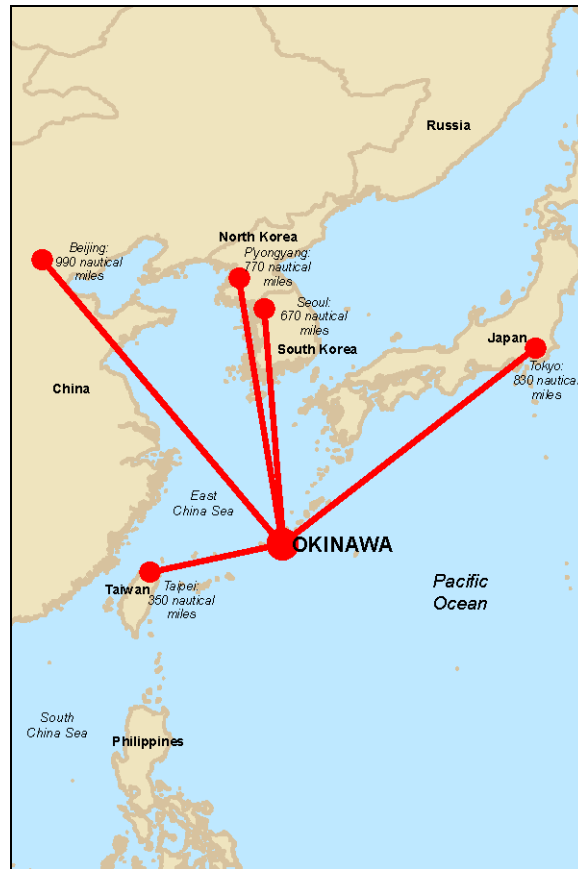
Figure I. Okinawa's Strategic Location