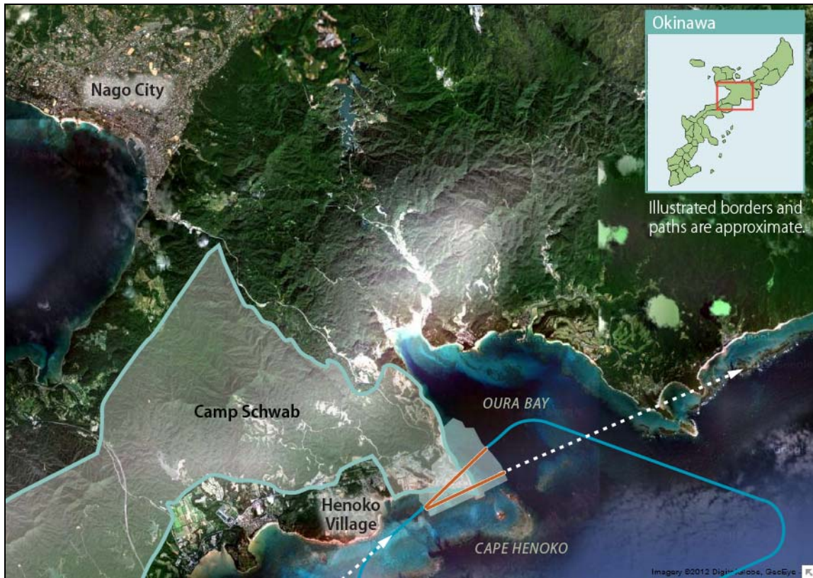
Figure 3. Location of Proposed Futenma Replacement Facility