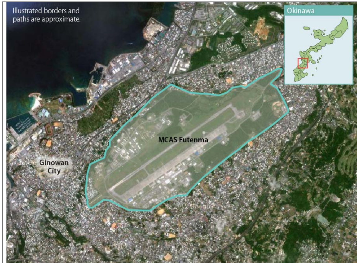
Figure 4. MCAS Futenma