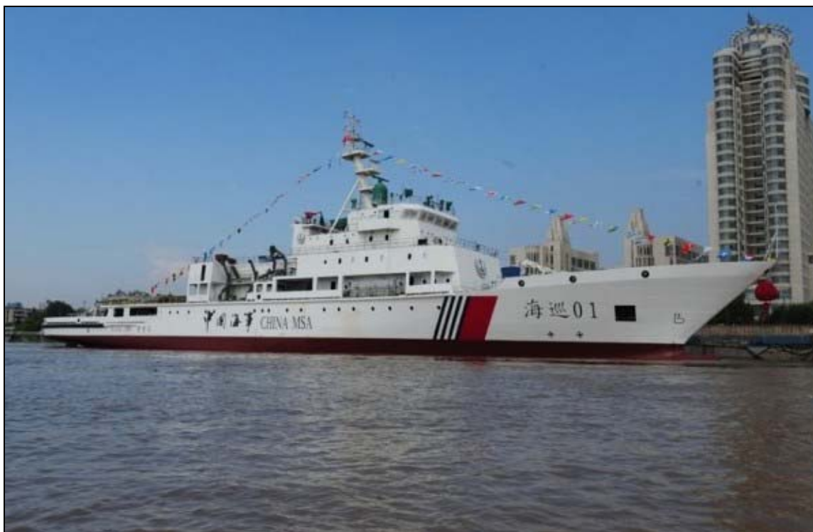
Figure 9. Haixun 01 Maritime Patrol Ship

Source: Shanghai Maritime Safety Administration ( http://www.shmsa.gov.cn/news/201207305563039713.html ), accessed July 31, 2012, as linked from “China Launches the Country’s Largest and Most Advanced Patrol Vessel,” The Maritime Executive , July 30, 2012, accessed July 31, 2012 at http://maritime-executive.com/article/china-launches-largest-and-most-advanced-patrol-vessel .