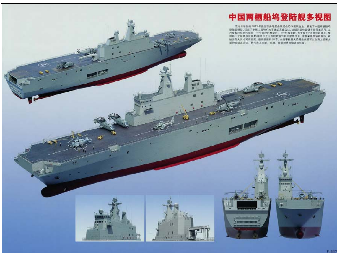
Figure 11. Type 081 LHD (Unconfirmed Conceptual Rendering of a Possible Design)