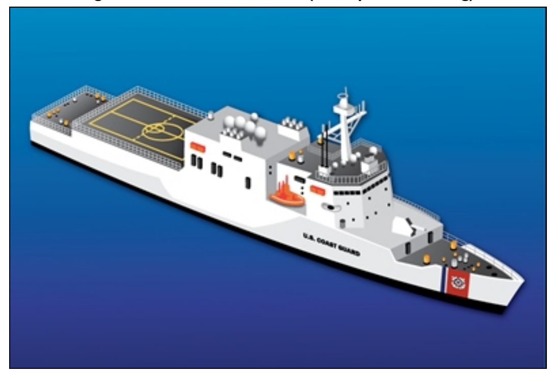
Figure 2. Offshore Patrol Cutter (Conceptual Rendering)