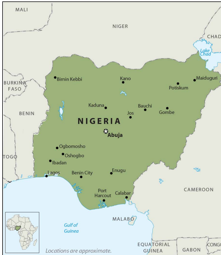
Figure 2. Map of Nigeria