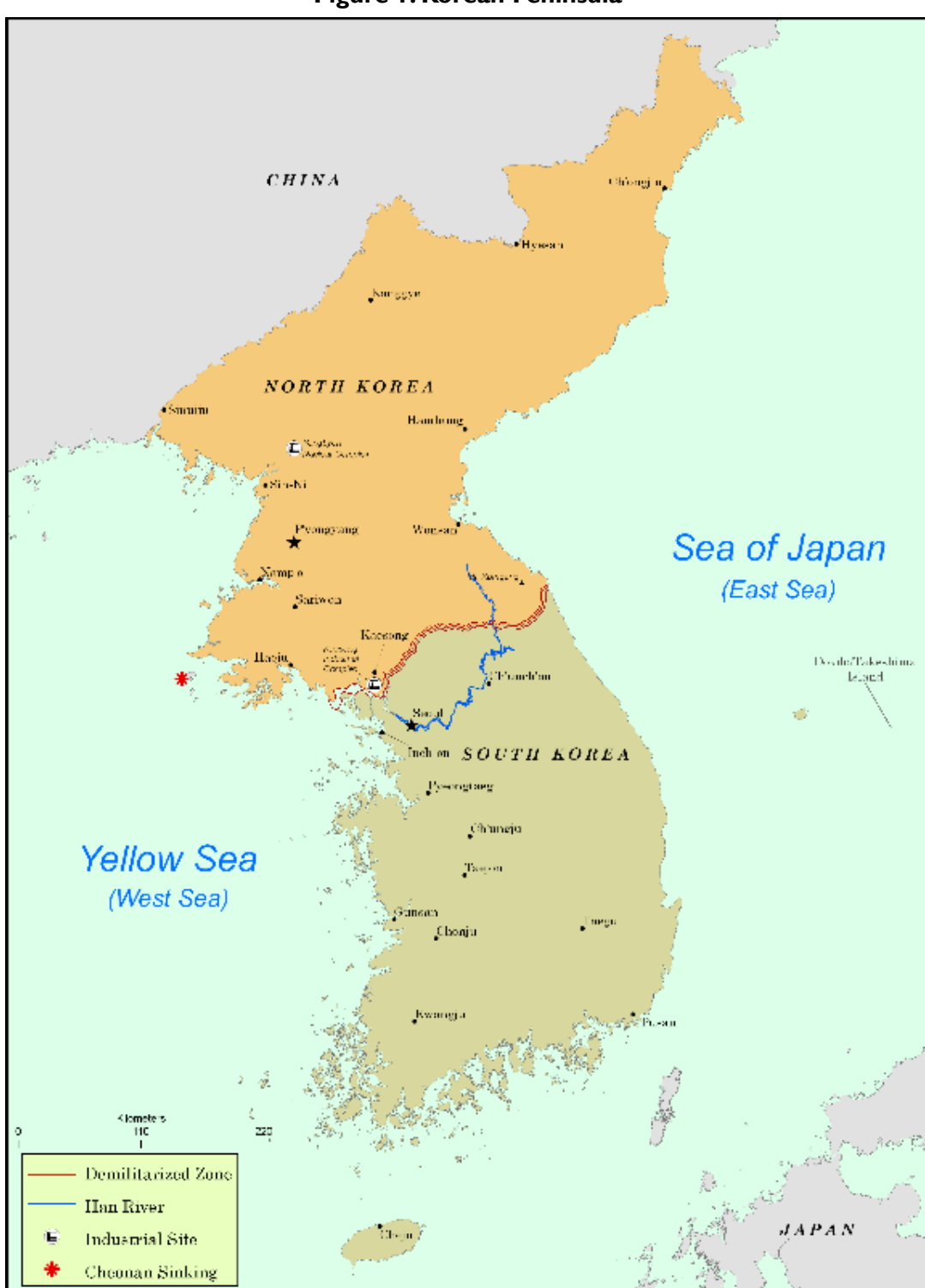
Figure I. Korean Peninsula