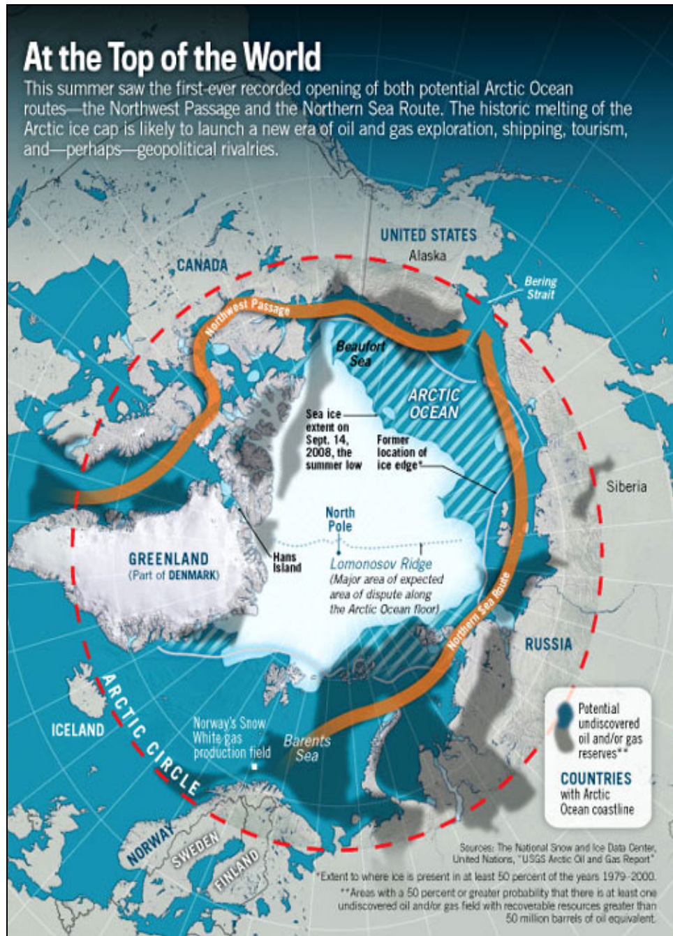
Figure 3. Arctic Sea Ice Extent in September 2008, Compared with Prospective Shipping Routes and Oil and Gas Resources