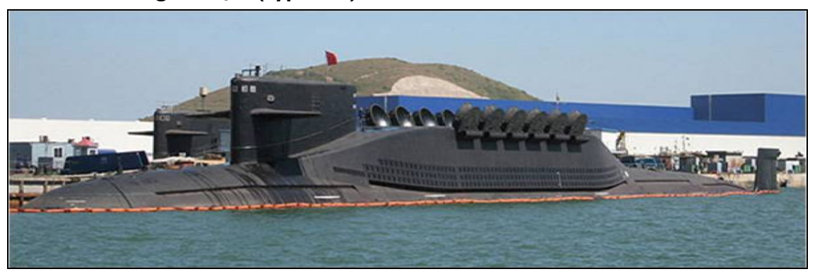
Figure 1. Jin (Type 094) Class Ballistic Missile Submarine