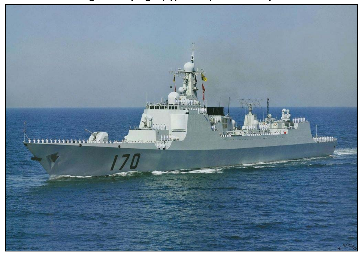
Figure 6. Luyang II (Type 052C) Class Destroyer

China since the early 1990s has deployed five new classes of indigenously built destroyers, one of which is a variation of another. The classes are called the Luhu (Type 052), Luhai (Type 051B), Luyang I (Type 052B), Luyang II (Type 052C), and Louzhou (Type 051C) designs. Compared to China's 13 remaining older Luda (Type 051) class destroyers, which entered service between 1971 and 1991, these five new indigenously built destroyer classes are substantially more modern in terms of their hull designs, propulsion systems, sensors, weapons, and electronics. The Luyang II-class ships appear to feature a phased-array radar that is outwardly somewhat similar to the SPY-1 radar used in the U.S.-made Aegis combat system. <sup>64</sup> Like the older Luda-class destroyers, these new destroyer classes are armed with ASCMs.