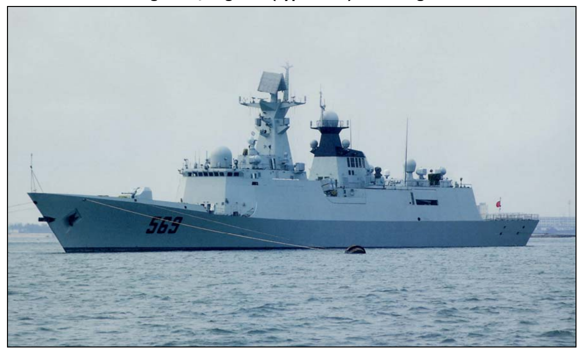
Figure 7. Jiangkai II (Type 054A) Class Frigate

Jiangwei II (Type 053H3), Jiangkai I (Type 054), and Jiangkai II (Type 054A) designs. Compared to China's 28 remaining older Jianghu (Type 053) class frigates, which entered service between the mid-1970s and 1989, the four new frigate classes feature improved hull designs and systems, including improved AAW capabilities. As shown in Table 3 , production of Jiangkai II-class ships continues, and Jane's projects an eventual total of 16.