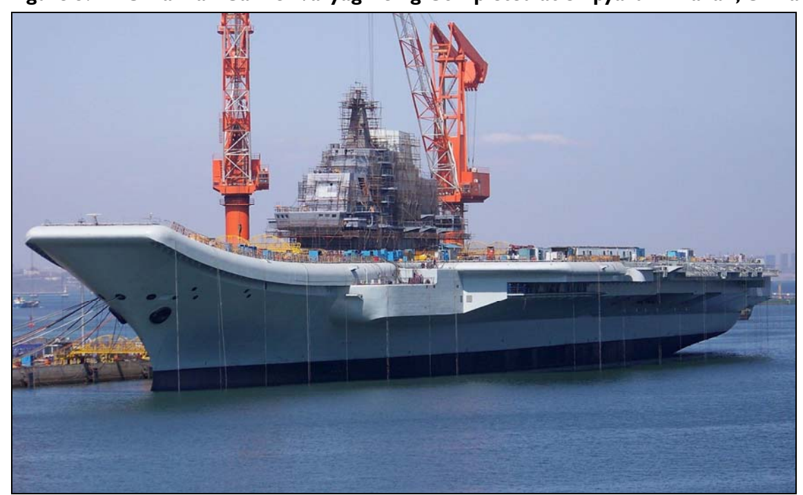
Figure 5. Ex-Ukrainian Carrier Varyag Being Completed at Shipyard in Dalian, China

China has had difficulty purchasing from Russia arresting wire systems that are needed for the ship to be able to support landings by fixed-wing aircraft.<sup>49</sup> At an August 24, 2011, DOD press briefing, a DOD said official that "the aircraft carrier could become operationally available to China's navy by the end of 2012, we assess, but without aircraft. It will take a number of additional years for an air group to achieve the sort of minimal level of combat capability aboard the carrier that will be necessary for them to start to operate from the carrier itself."<sup>50</sup>