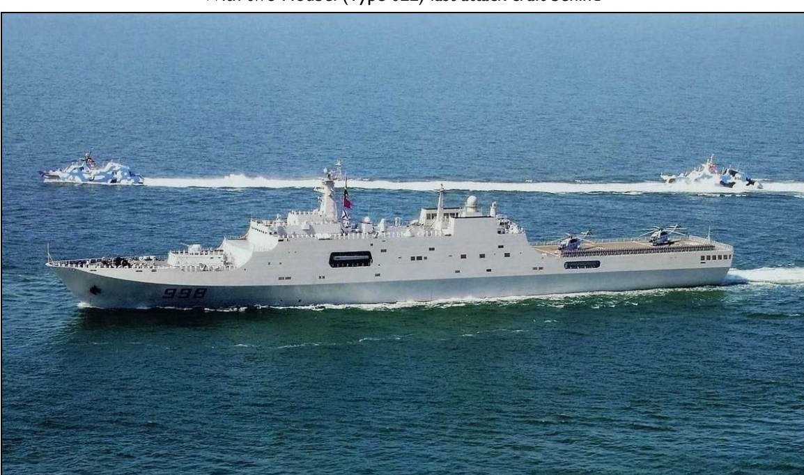
Figure 9. Yuzhao (Type 071) Class Amphibious Ship

The Type 071 design has an estimated displacement of 17,600 tons, compared with about 15,900 tons to 16,700 tons for the U.S. Navy's Whidbey Island/Harpers Ferry (LSD-41/49) class amphibious ships, which were commissioned into service between 1985 and 1998, and about 25,900 tons for the U.S. Navy's new San Antonio (LPD-17) class amphibious ships, the first of which was commissioned into service in 2006.