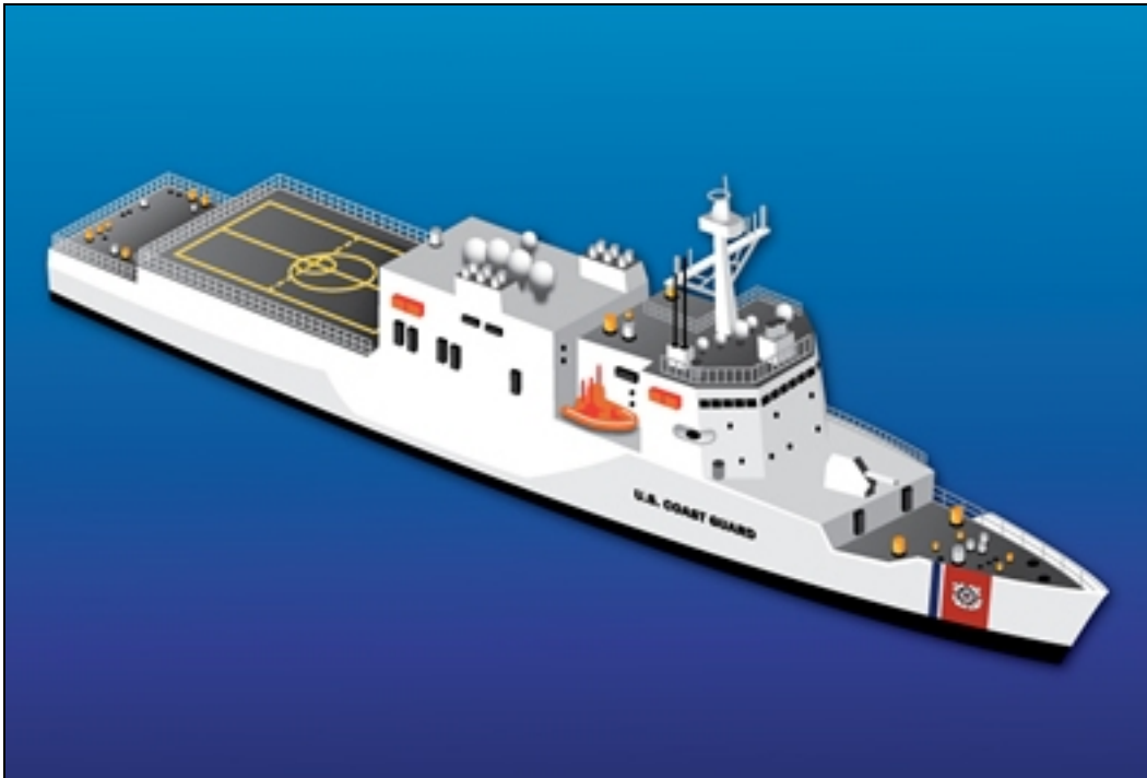
Figure 2. Offshore Patrol Cutter (Conceptual Rendering)