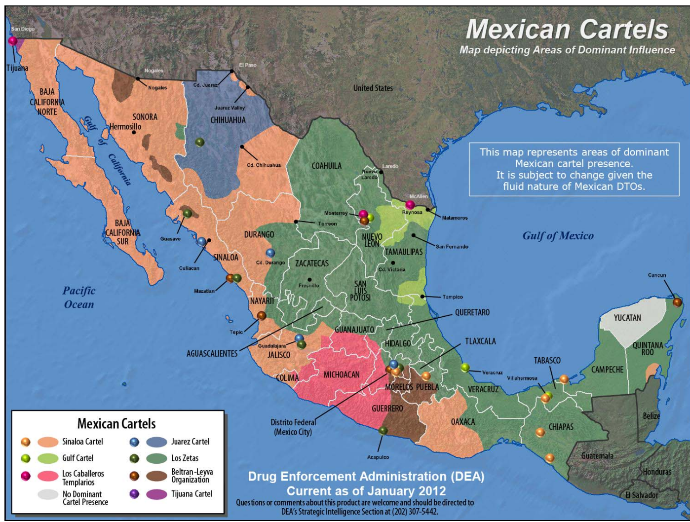
Figure I. Map of DTO Areas of Dominant Influence in Mexico by DEA