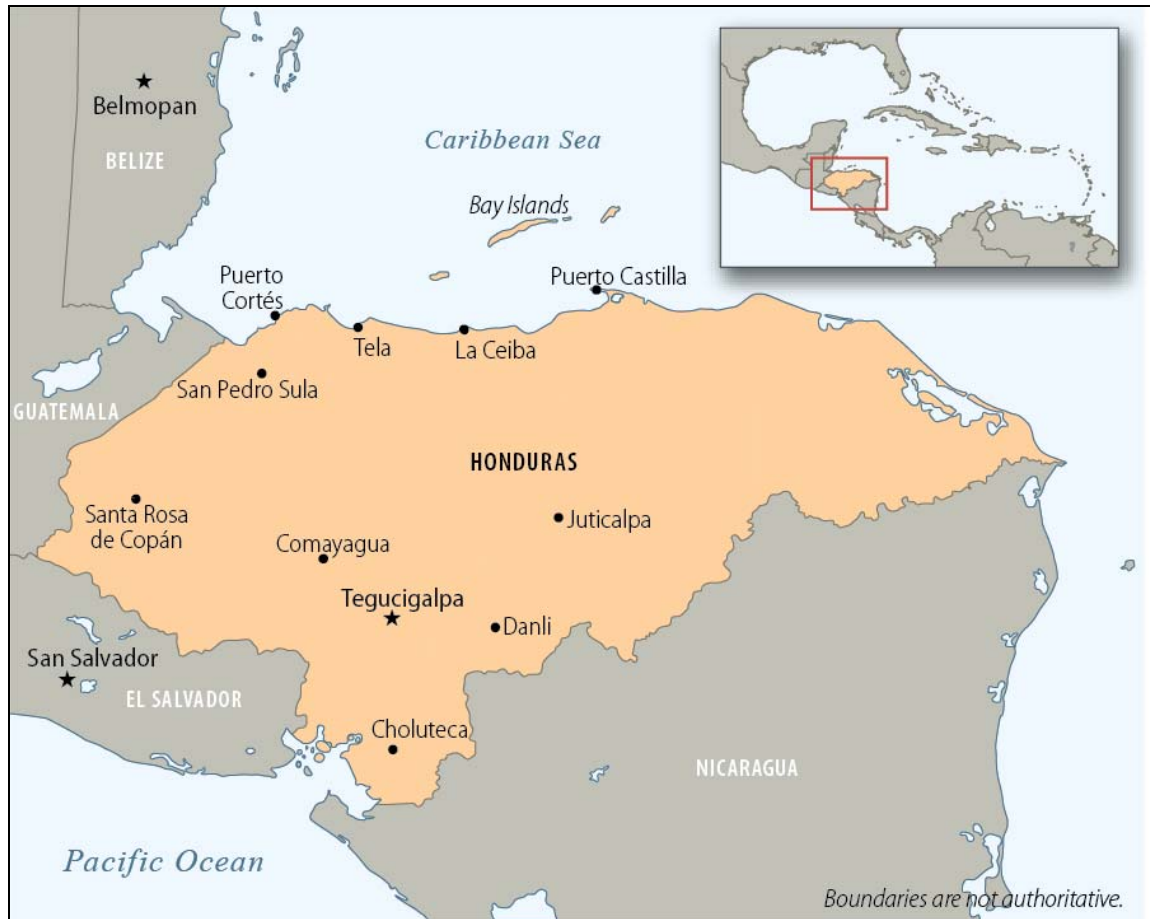
Figure I. Map of Honduras