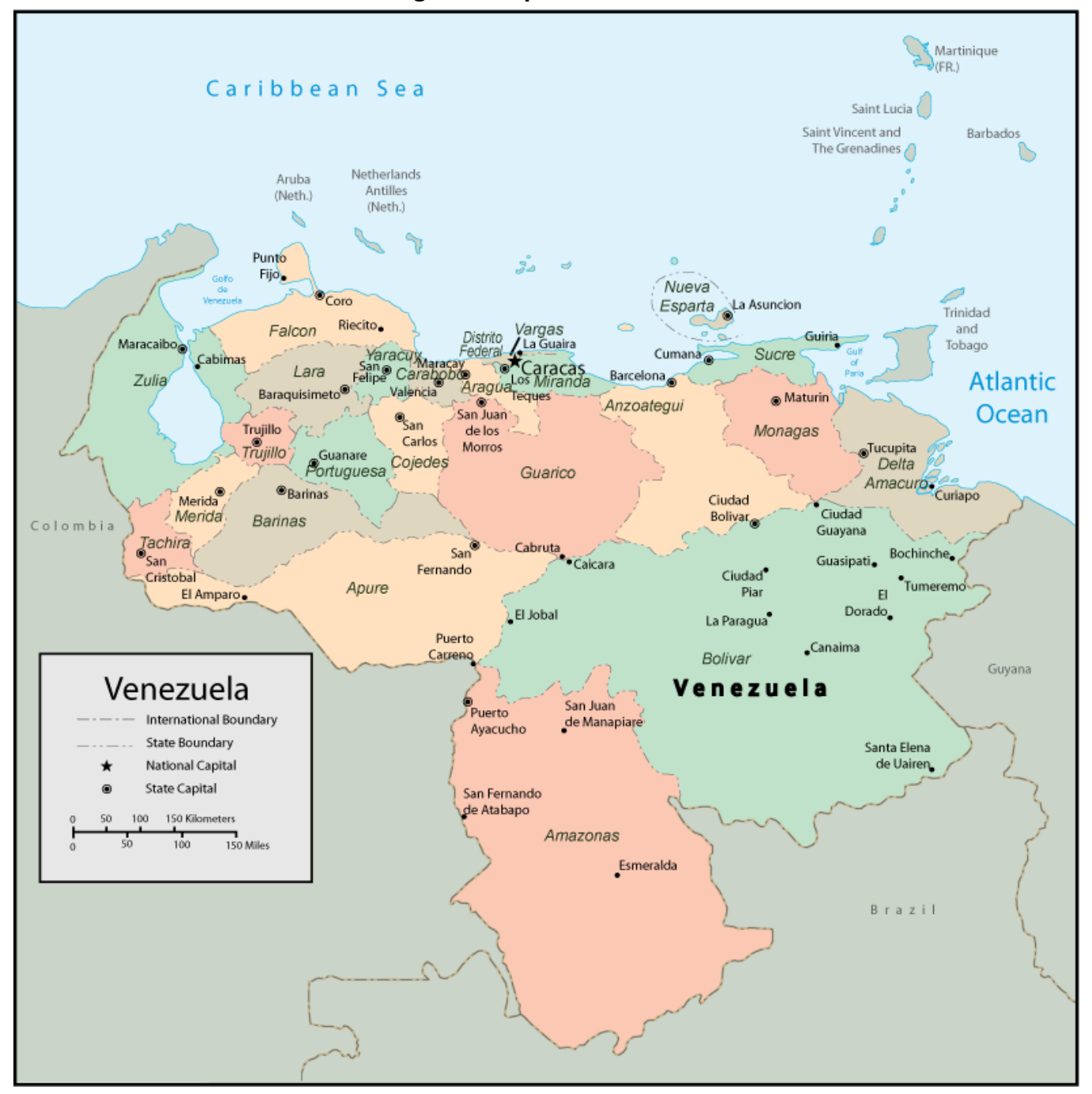
Figure 1. Map of Venezuela