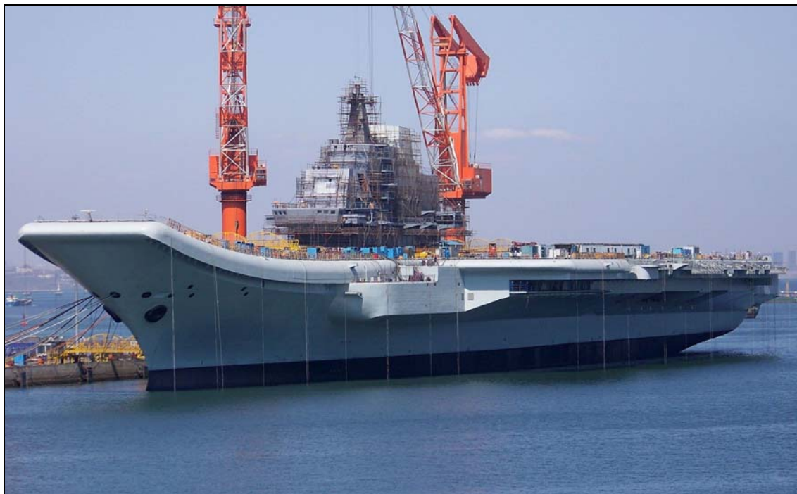
Figure 5. Ex-Ukrainian Carrier Varyag Being Completed at Shipyard in Dalian, China