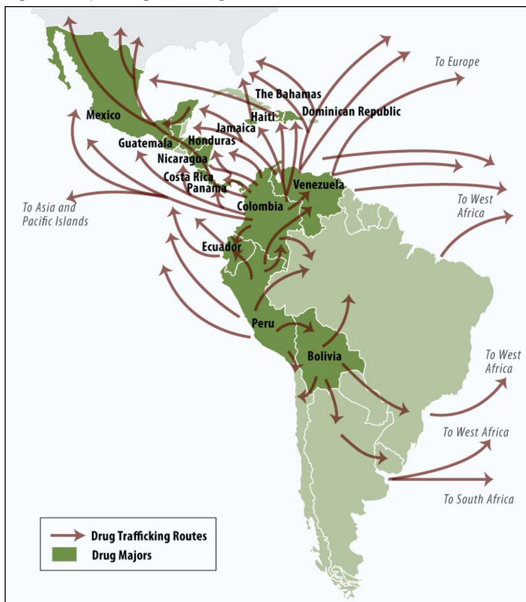
Figure I. Major Drug Trafficking Routes in Latin America and the Caribbean