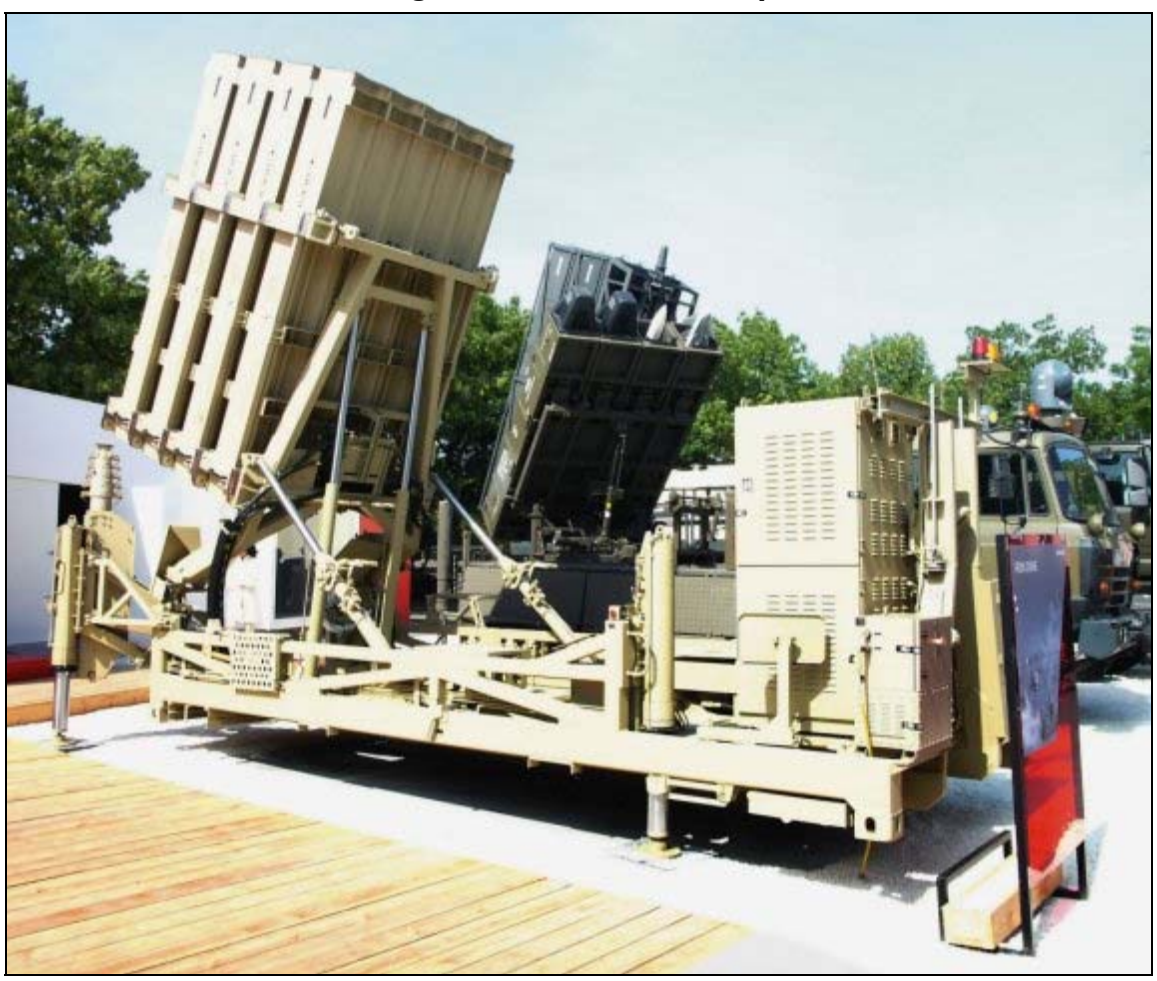
Figure 2. Iron Dome Battery