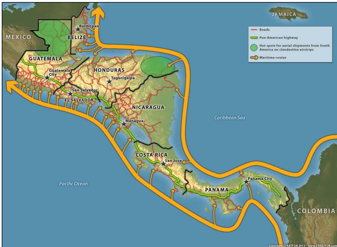
Figure 3. Central American Drug Trafficking Routes