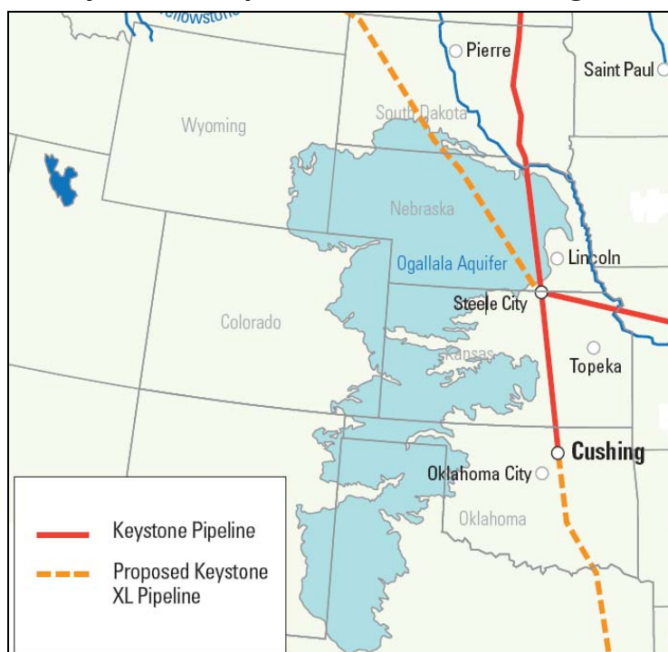
Figure 2. Keystone XL Pipeline Route Across the Ogallala Aquifer