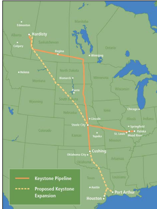
Figure 1. TransCanada Keystone Pipeline and Original Keystone XL Proposed Route