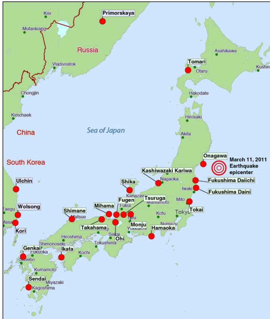
Figure 1. Japan Earthquake Epicenter and Nuclear Plant Locations