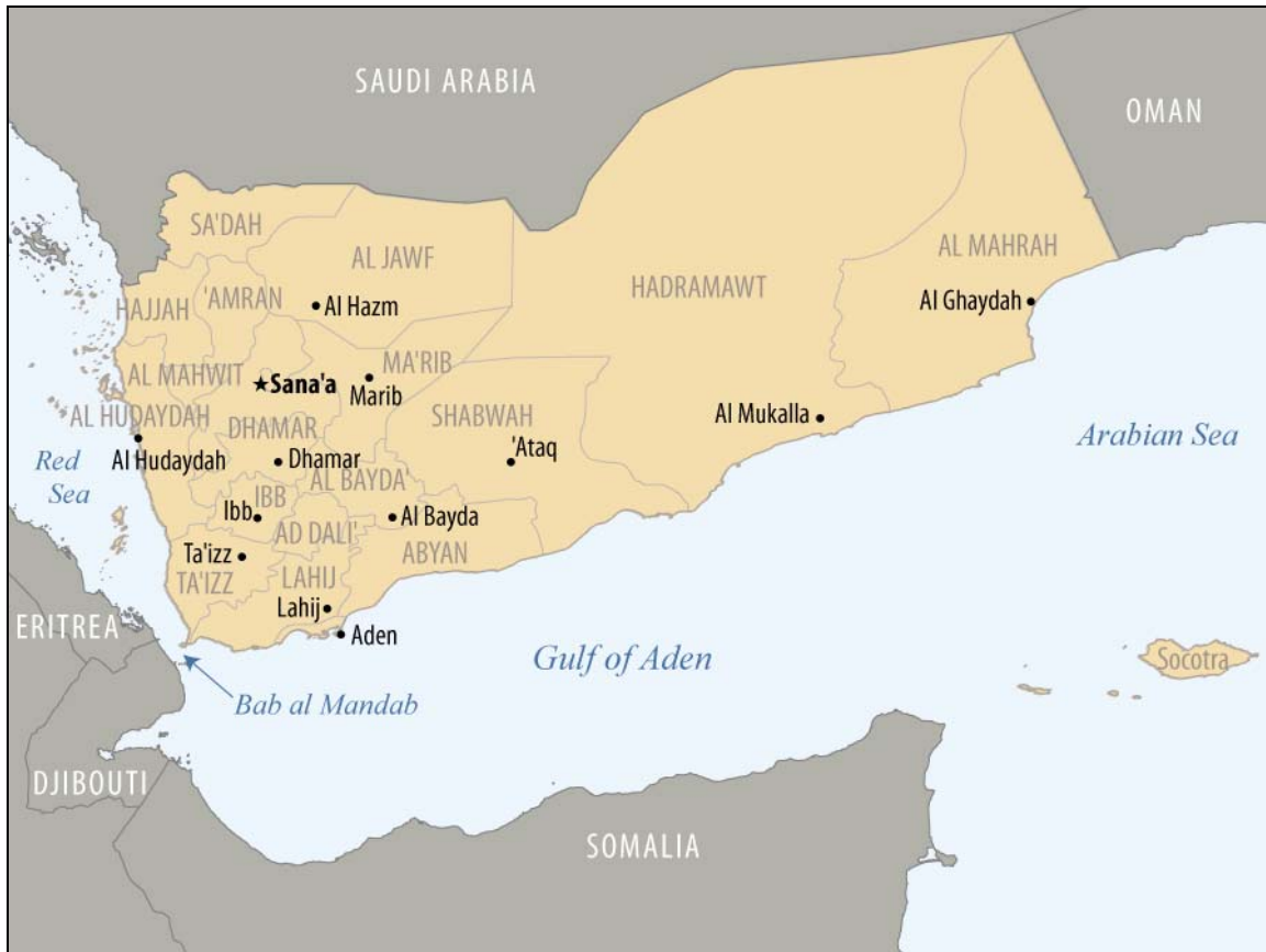
Figure 2. Map of Yemen