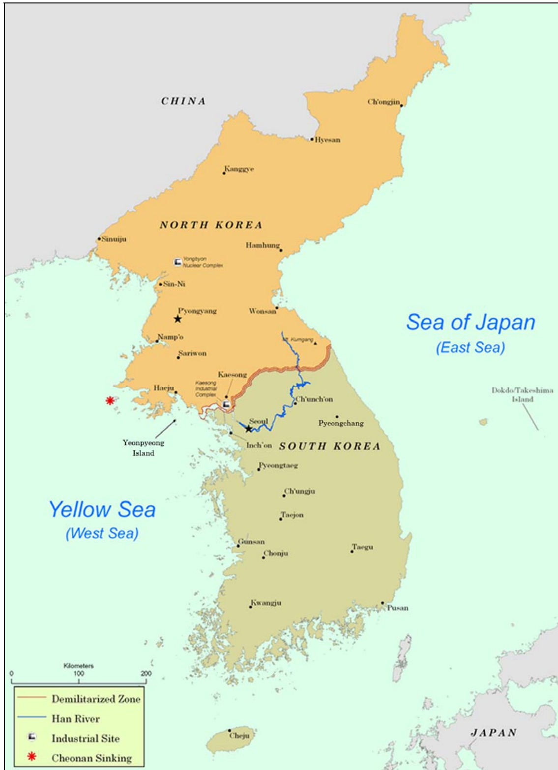
Figure I. Map of the Korean Peninsula